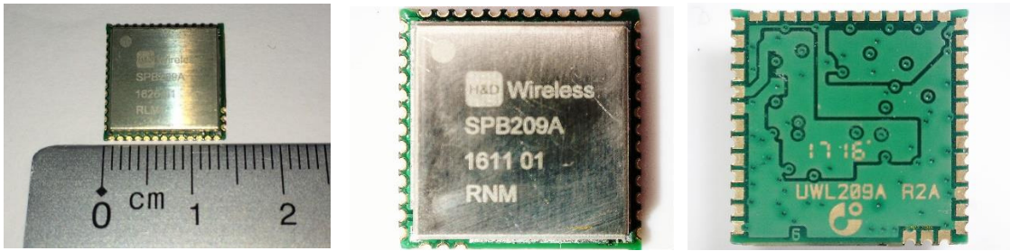
Figure 1, SPB209A RF module top and bottom