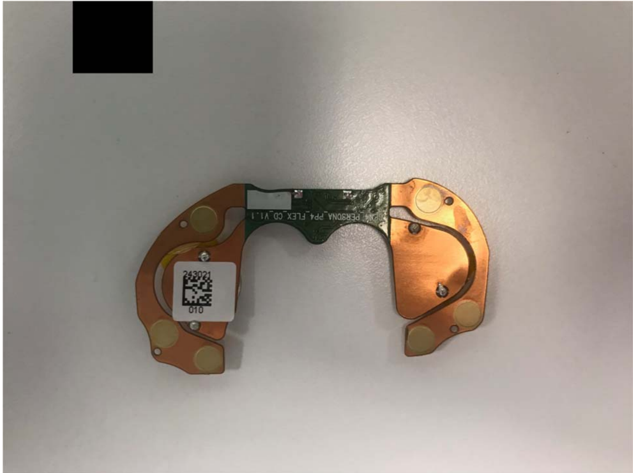
Figure 3: Dial Side View of PCB.

Note: the foil antenna was removed to allow the circuit board to be viewed.