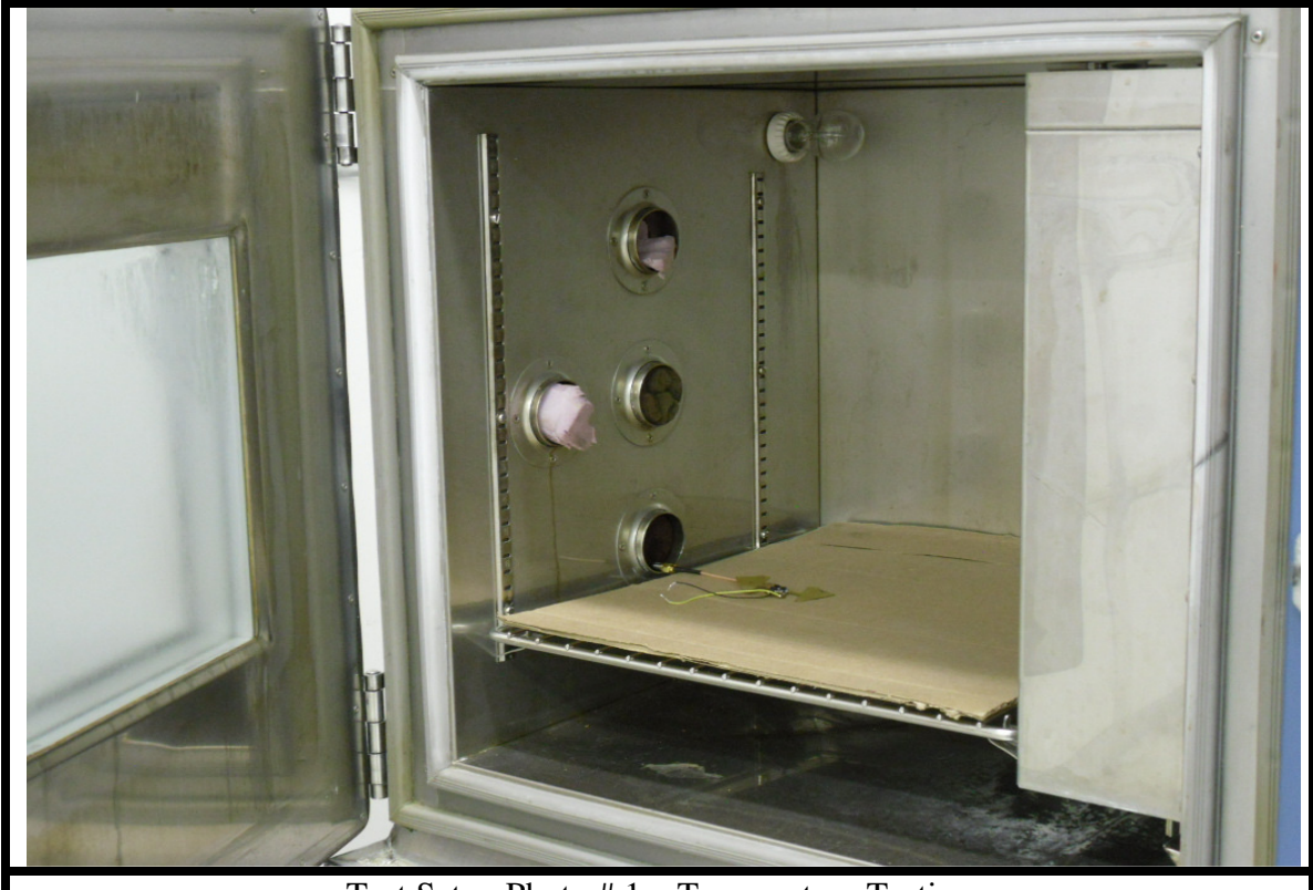
Test Setup Photo # 1 – Temperature Testing