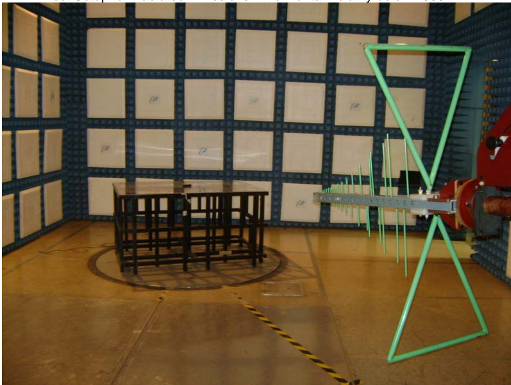
Test Setup for Radiated Emissions – Vertical Polarity below 1000MHz