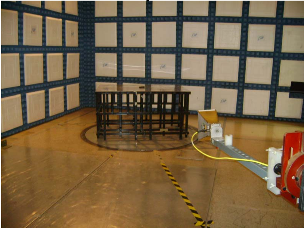
Test Setup for Radiated Emissions – Horizontal Polarity above 1000MHz