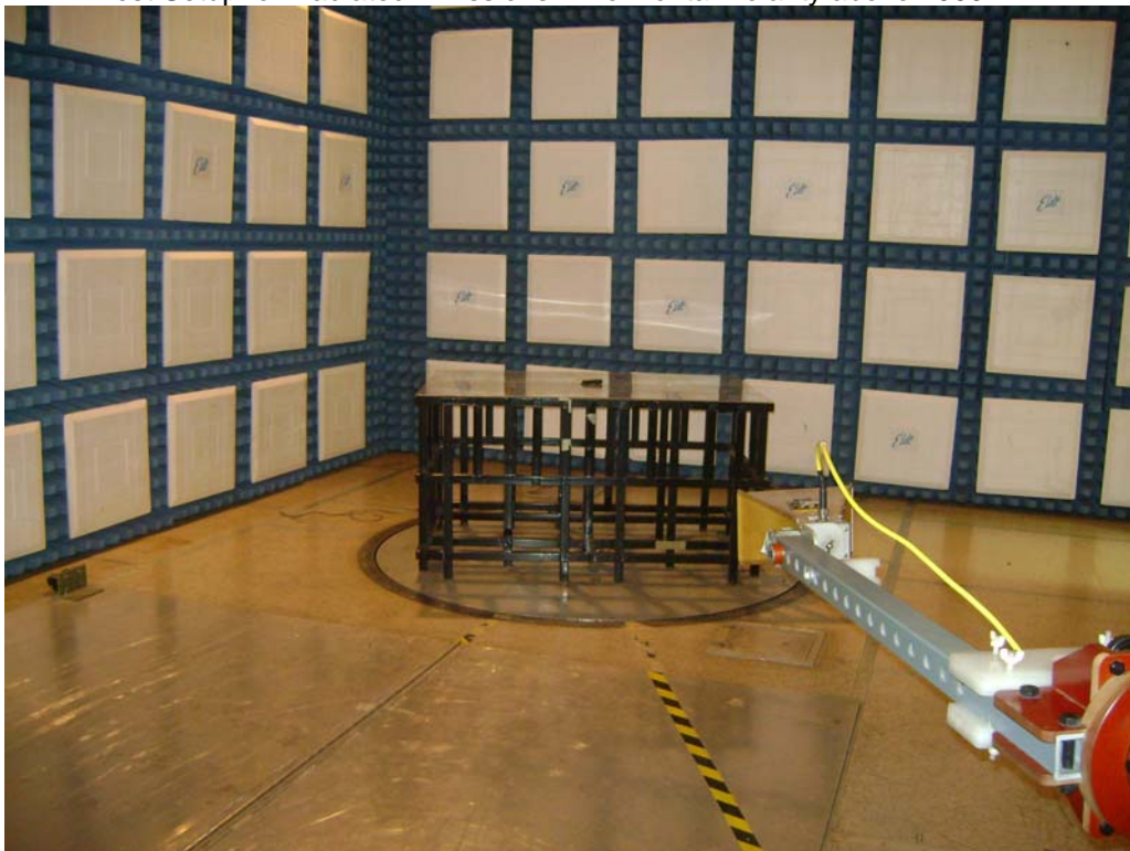
Test Setup for Radiated Emissions – Vertical Polarity above 1000MHz