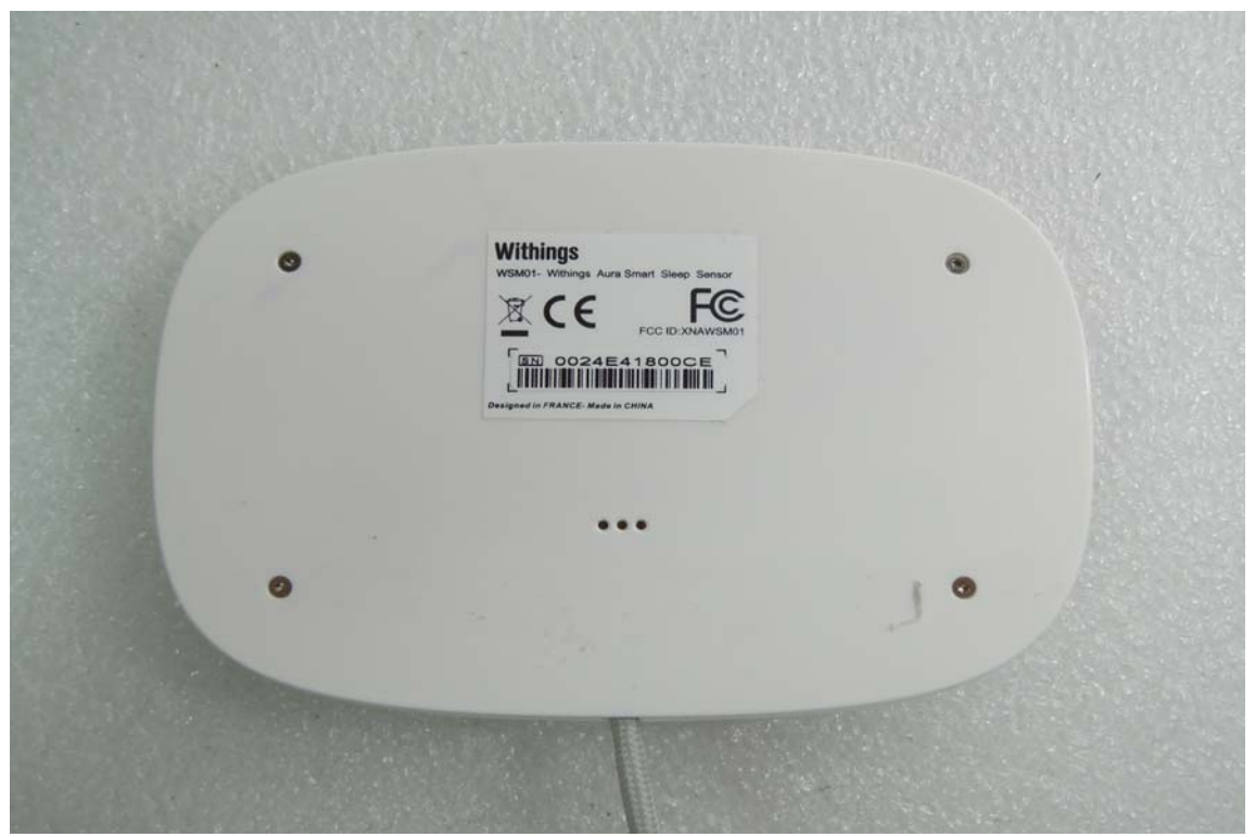
Side View of EUT - 1