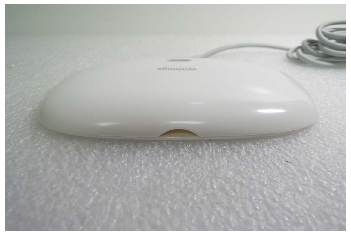
Side View of EUT – 3