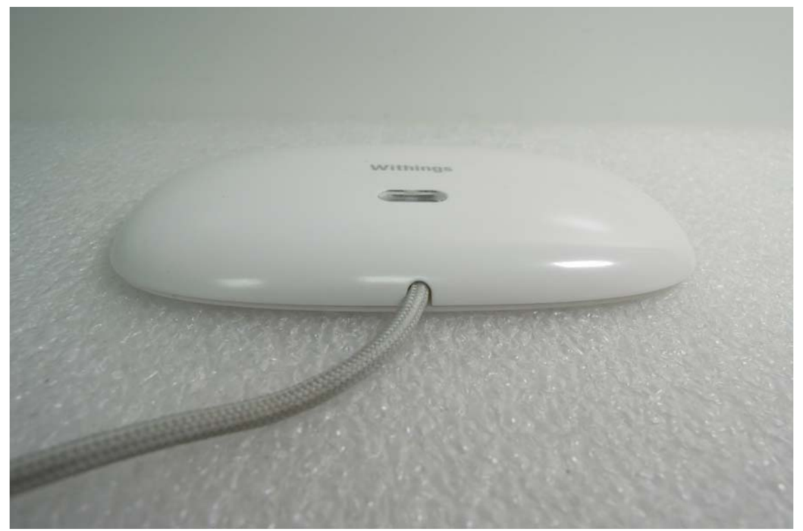
Adapter – 1