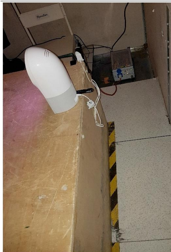
Test setup for conducted emission