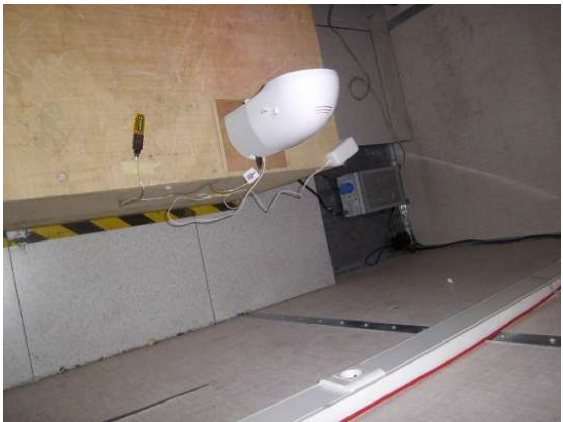
Test setup for power line conducted emissions