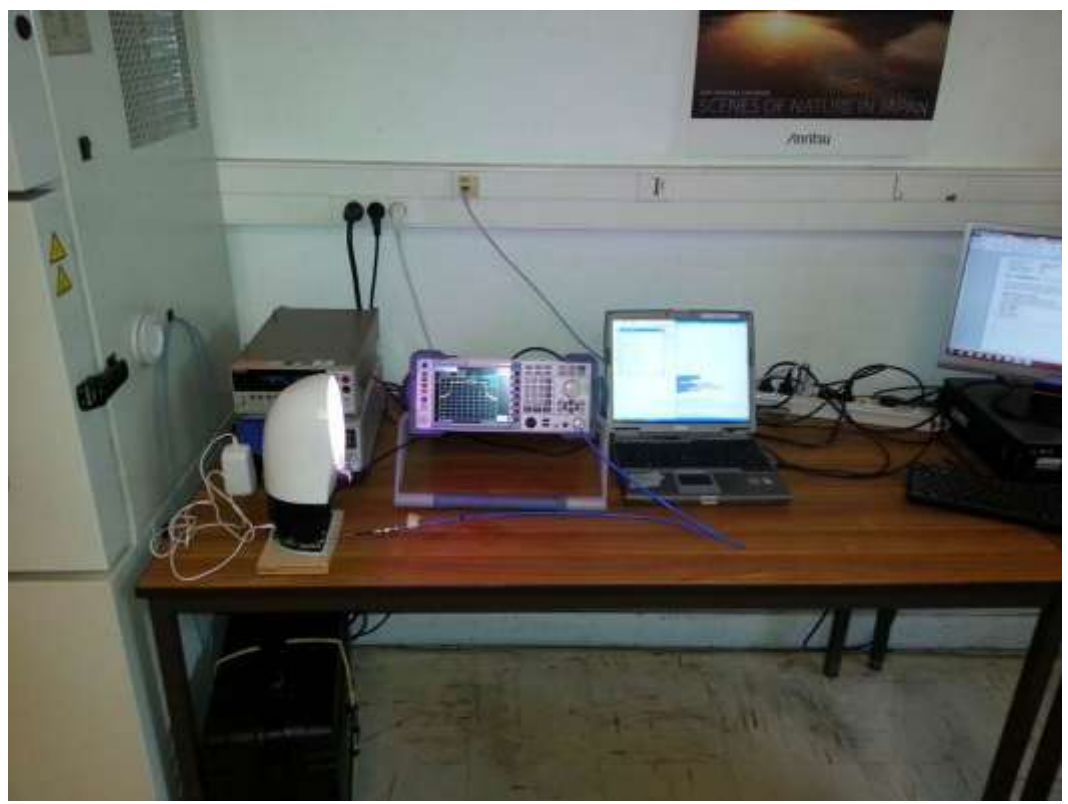
Test setup for radio conducted tests