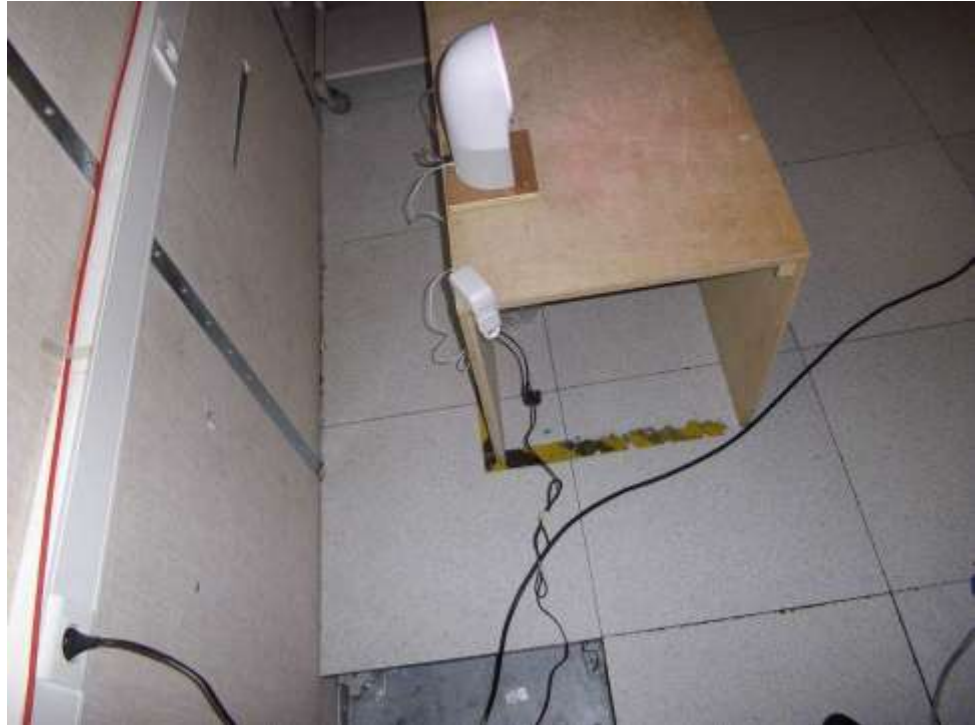
Test setup for power line conducted emissions