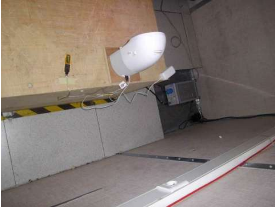
Test setup for power line conducted emissions