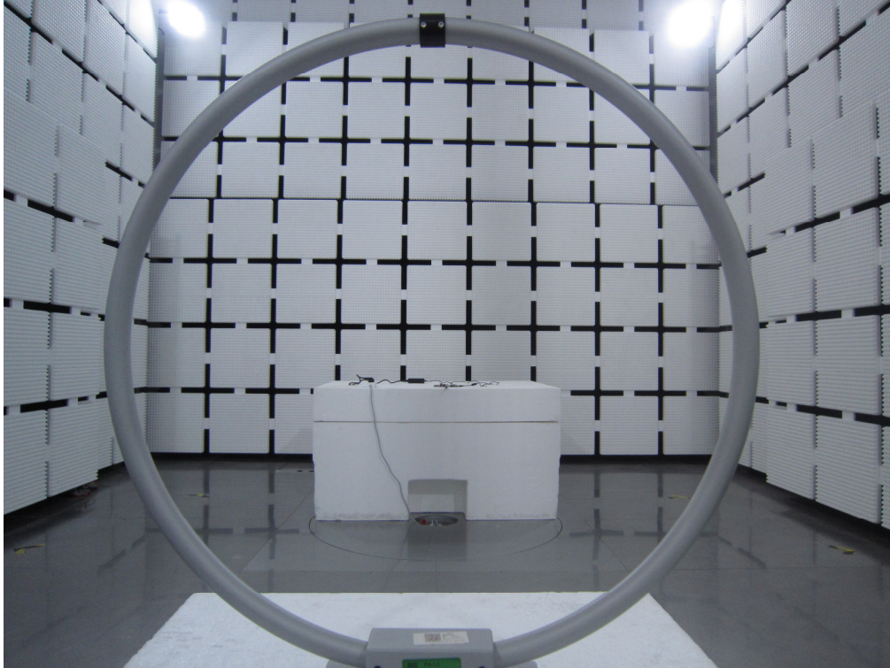
Performed by SGS-CSTC Standards Technical Services Co., Ltd. Shenzhen Branch