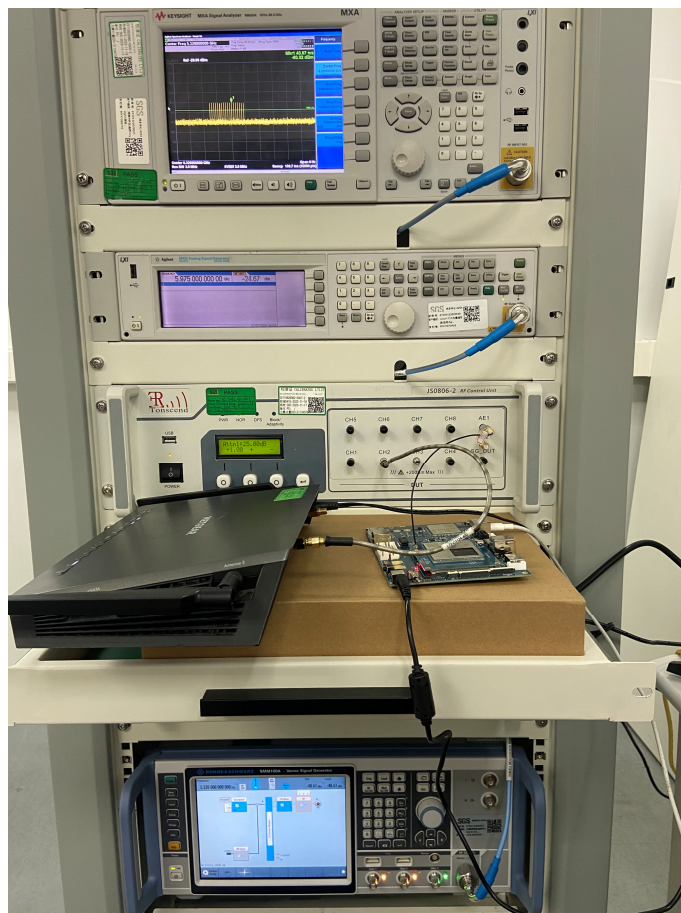
Performed by SGS-CSTC Standards Technical Services Co., Ltd. Shenzhen Branch