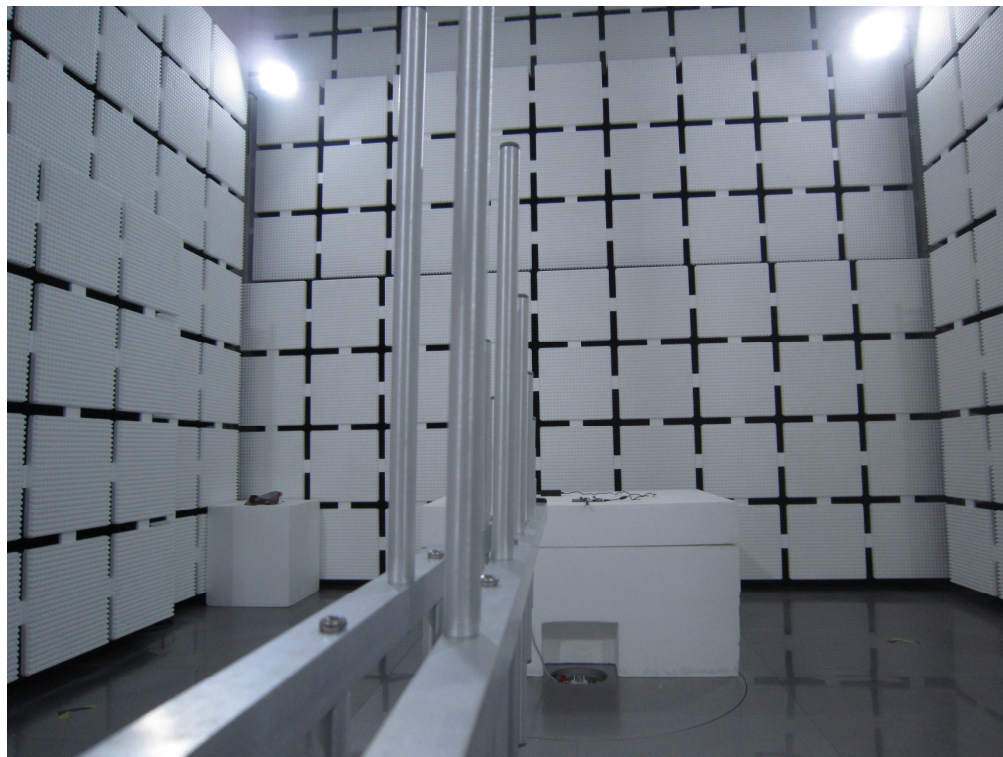
Performed by SGS-CSTC Standards Technical Services Co., Ltd. Shenzhen Branch