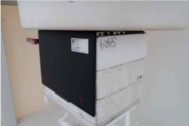
Bottom of Laptop at 0 mm