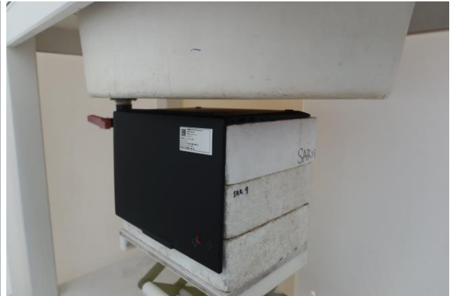
Bottom of Laptop at 20 mm