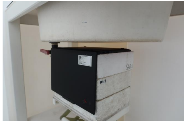
Bottom of Laptop at 25 mm