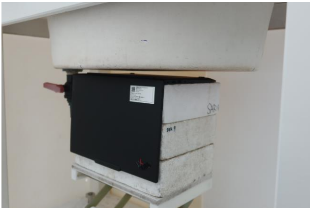
Bottom of Laptop at 10 mm