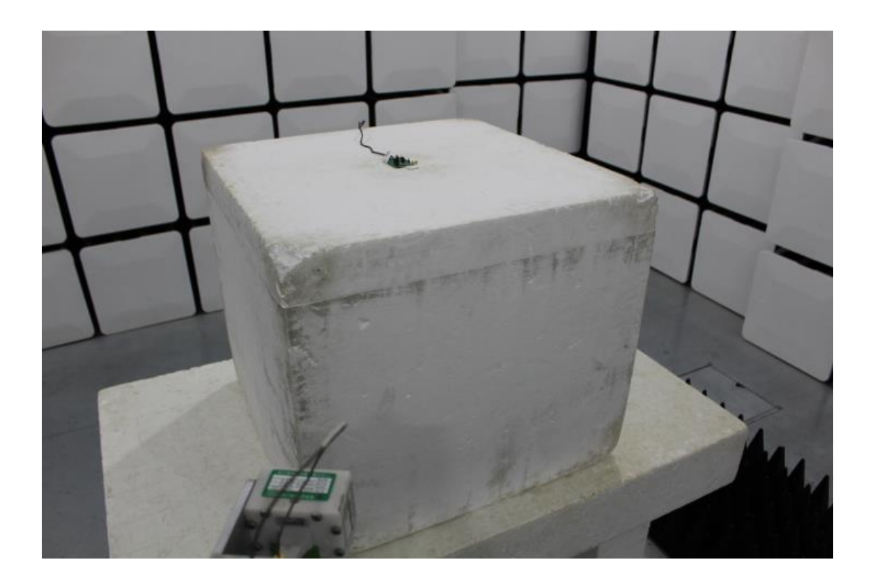
---End of Attachment---