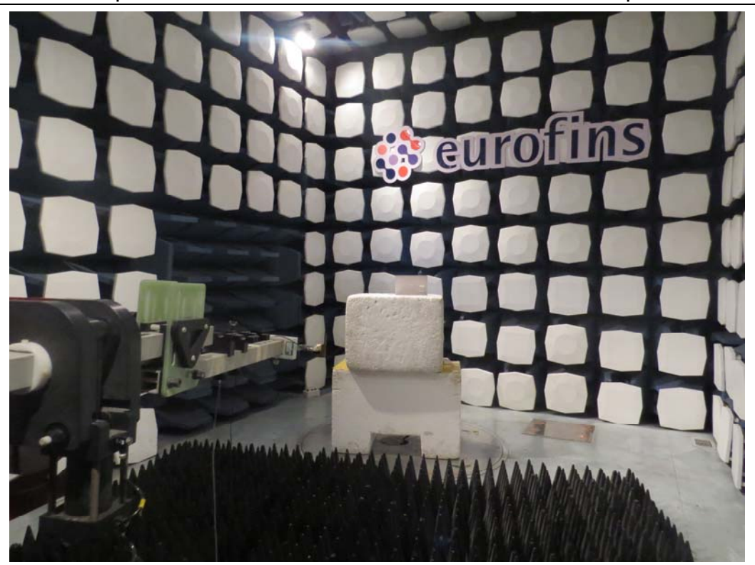
26.5GHz -40GHz Picture 1 Radiated Emission Test Setup