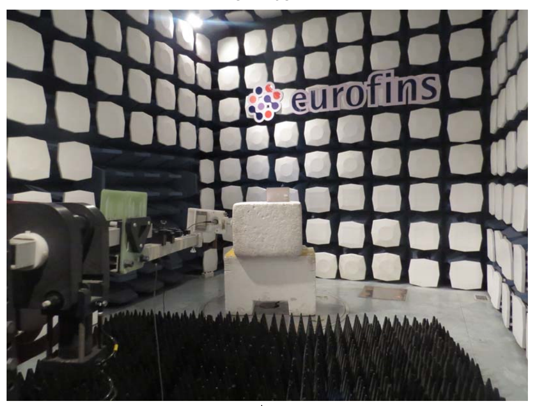
18GHz - 26.5GHz