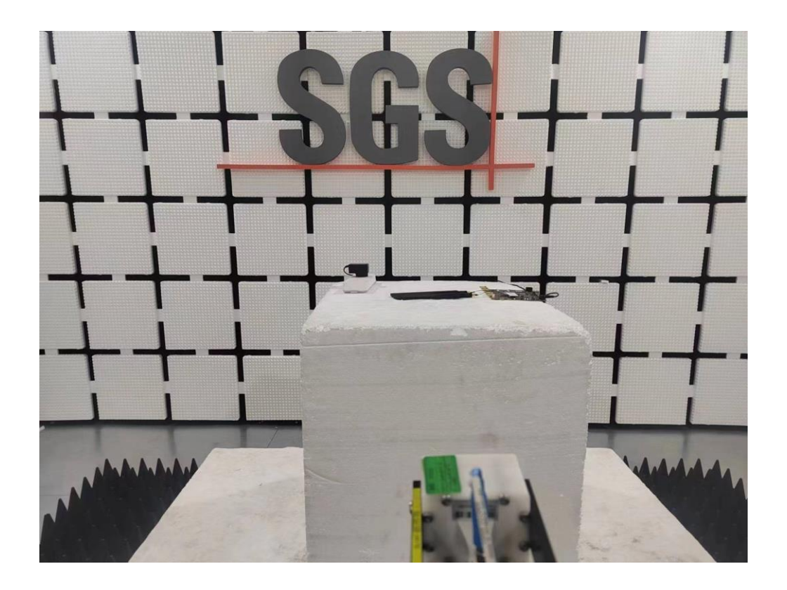
---End of Attachment---