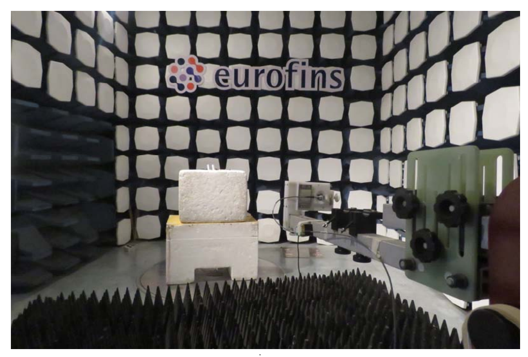
18GHz - 26.5GHz Picture 1 Radiated Emission Test Setup