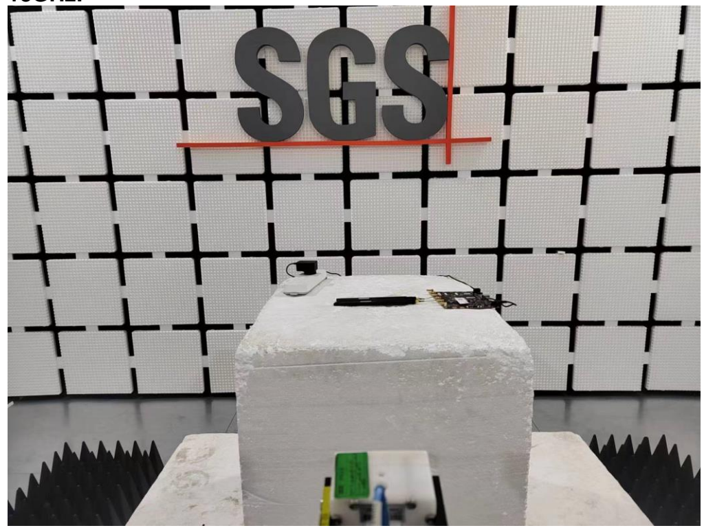
---End of Attachment---