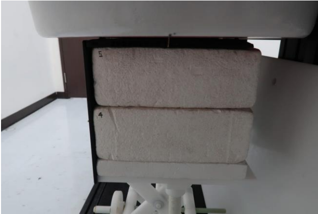
Bottom of Laptop, Test Separation 0 mm