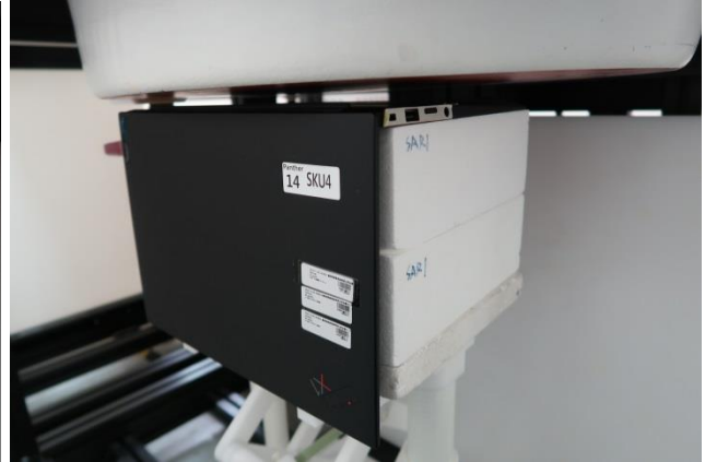
Bottom of Laptop, Test Separation 15 mm