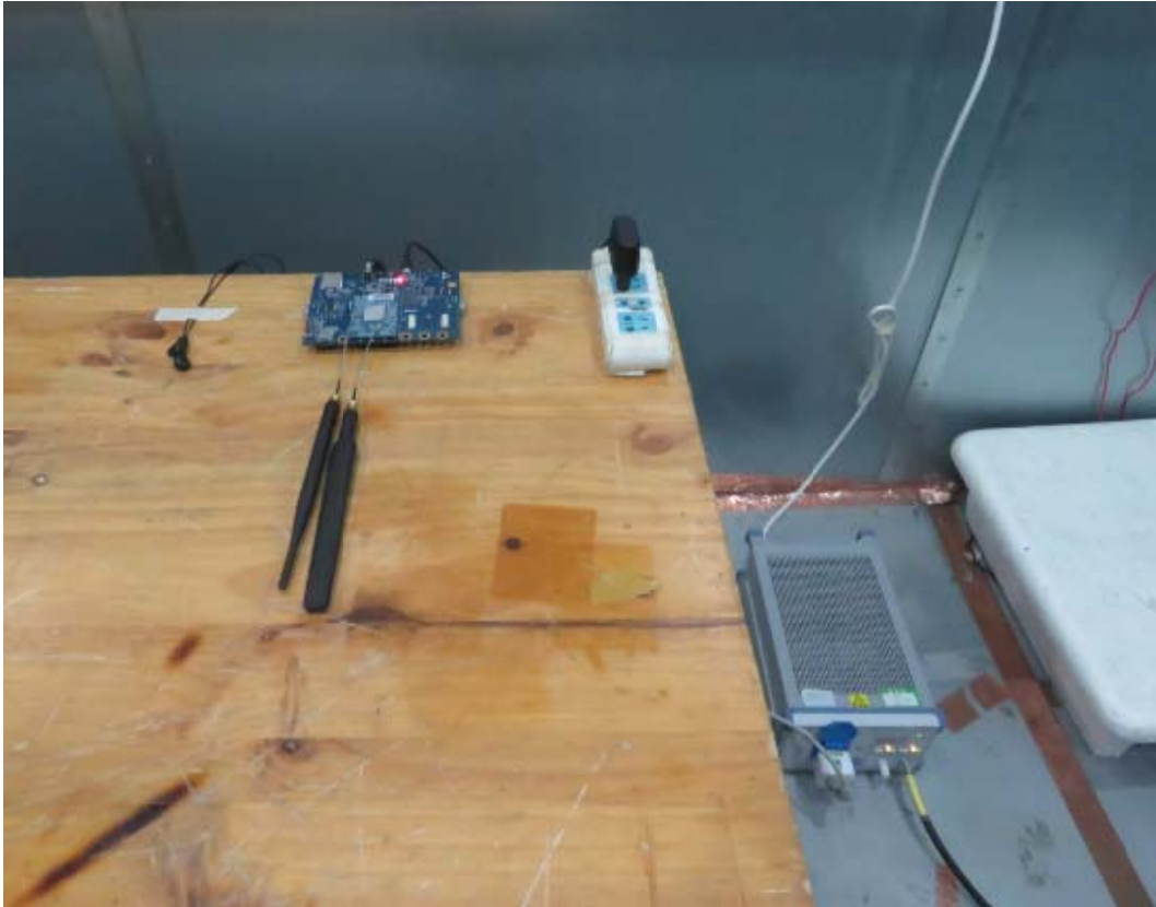
Picture 2 Conducted Emission Test Setup