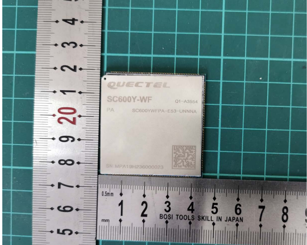
TA Technology (Shanghai) Co., Ltd.