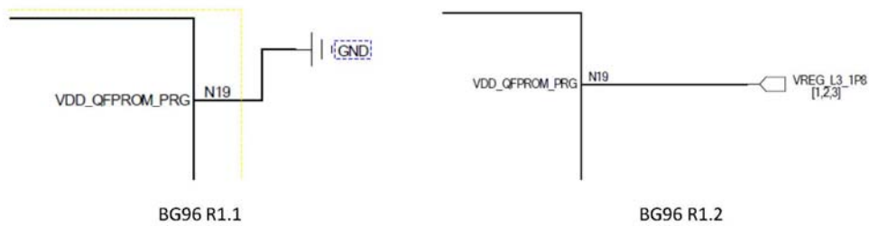
Figure 1: Schematic Designs of BG96 R1.1 and R1.2