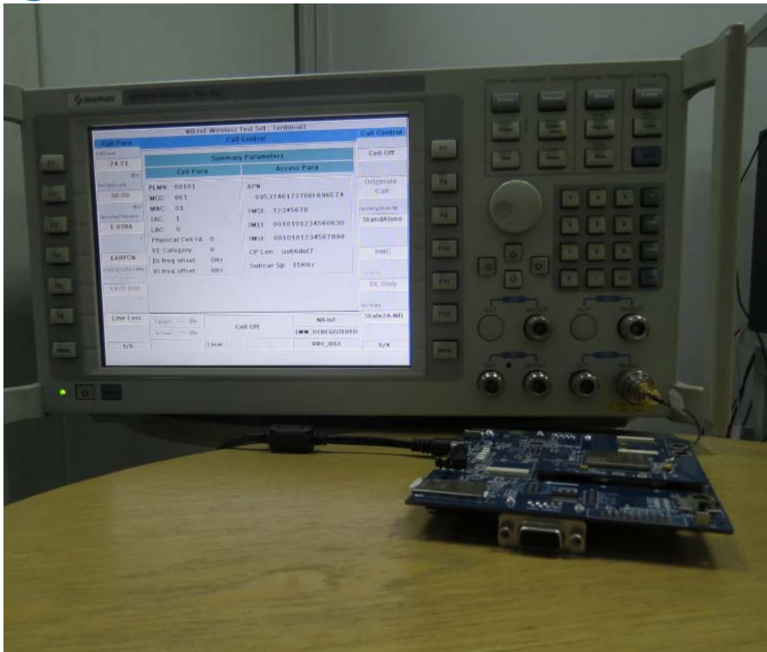
RF conducted test setup