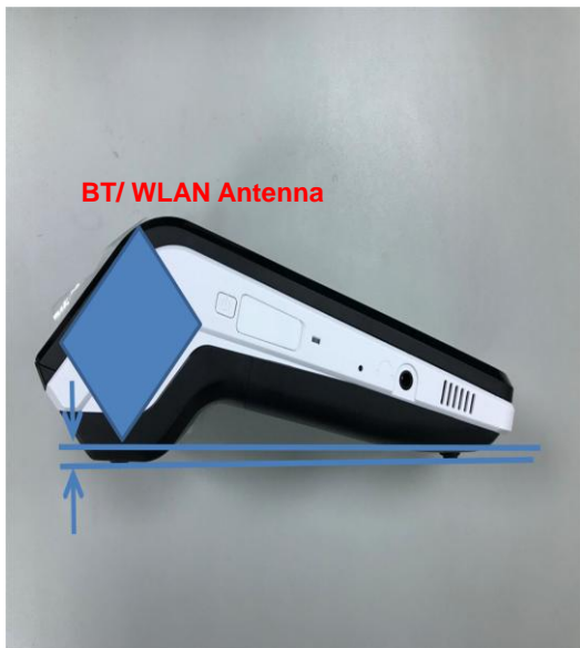
<Edge side View>