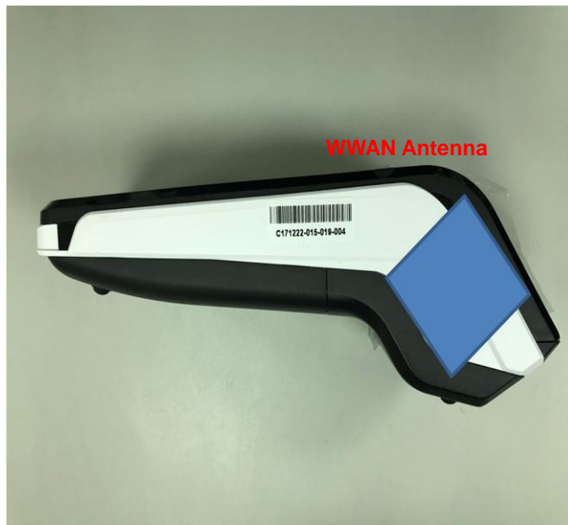
<Edge side View>

The separation distance for antenna to edge: