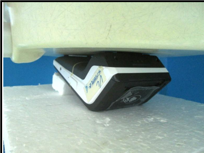
Body - Rear Face of EUT at 0 mm