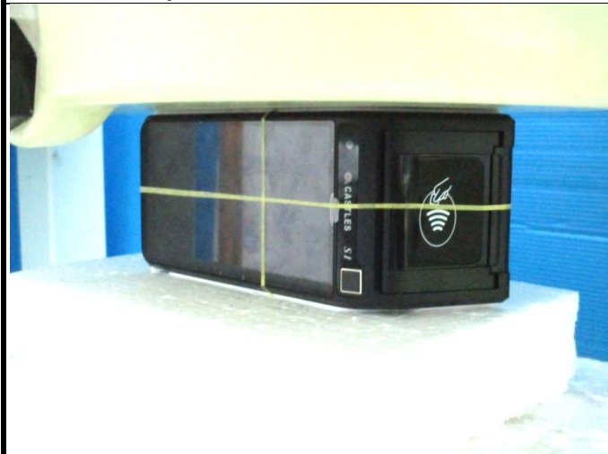
Body - Left Side of EUT at 0 mm