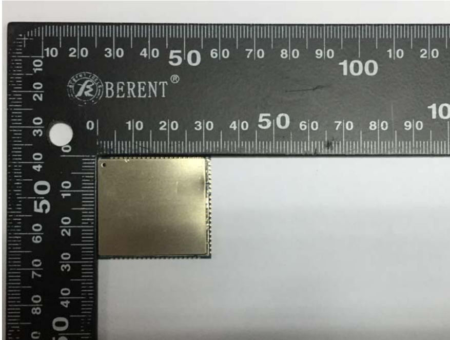
EUT – Bottom View(EC21-A)