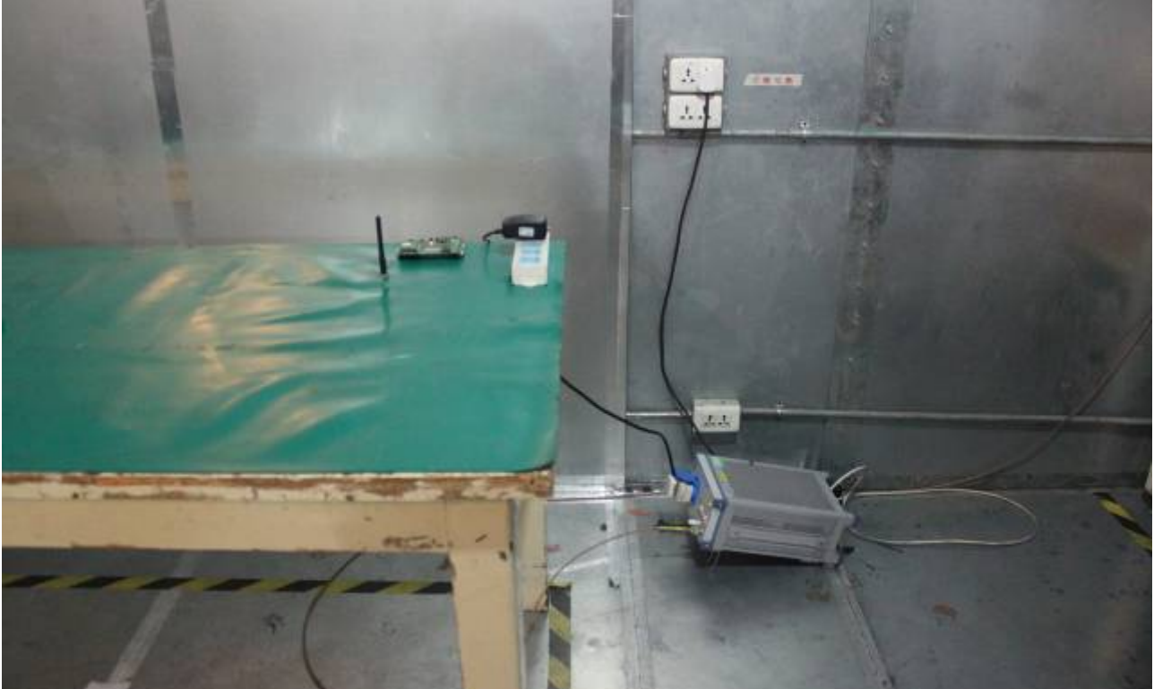
RADIATED EMISSION TEST