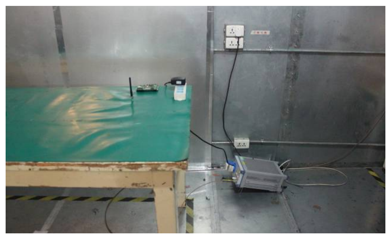
RADIATED EMISSION TEST