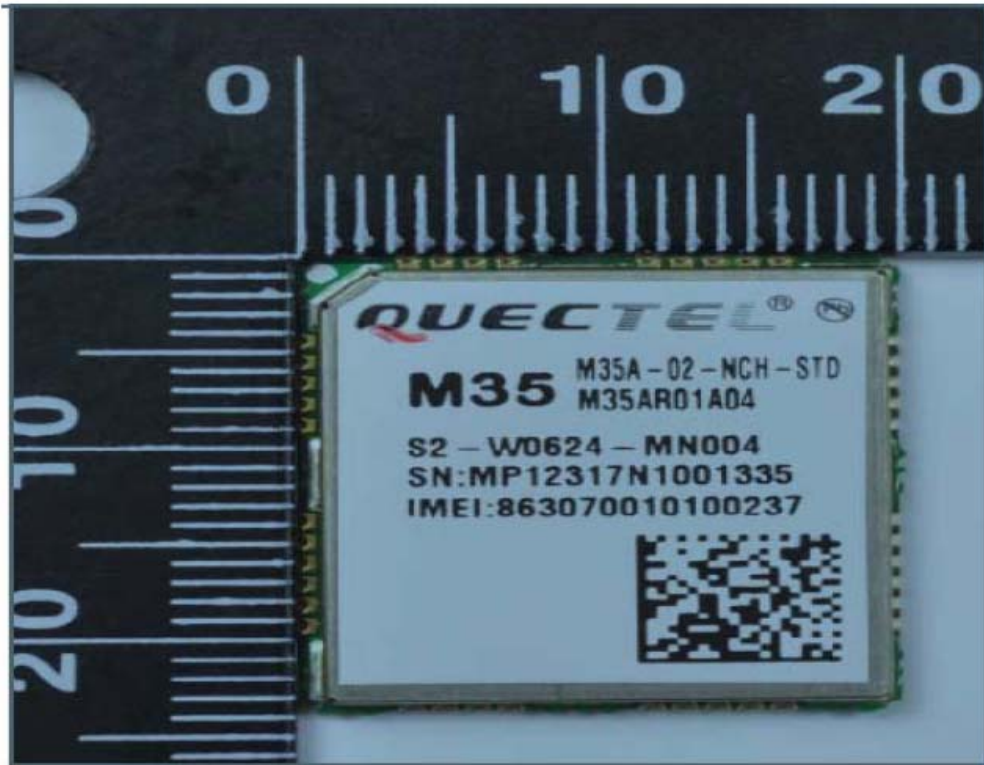
EUT -Top View