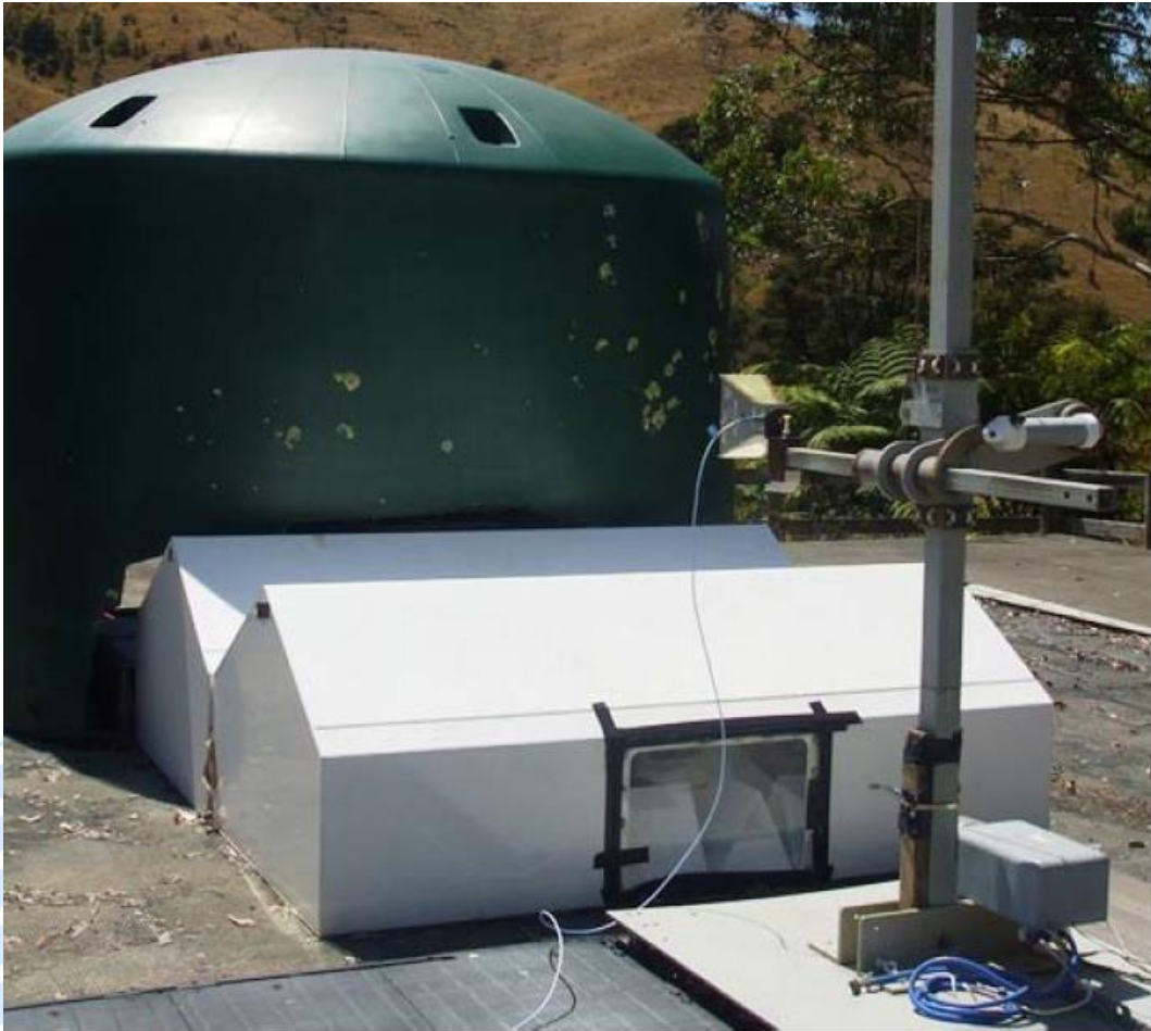
EMCO 3115 Horn Antenna (1 – 18 GHz)