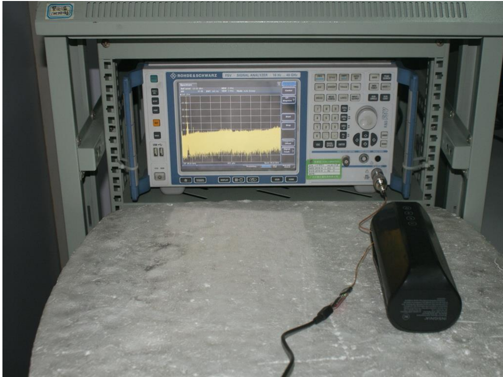
RF Conducted Test