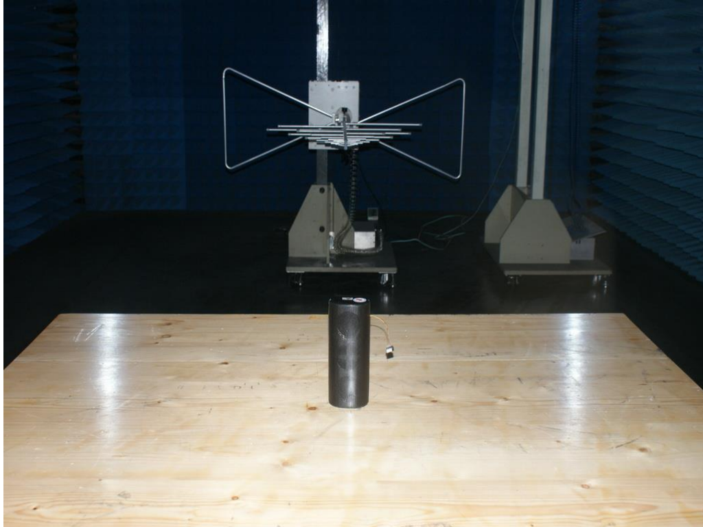
Photograph 2: Set-up for Spurious Emissions (30MHz-1GHz)