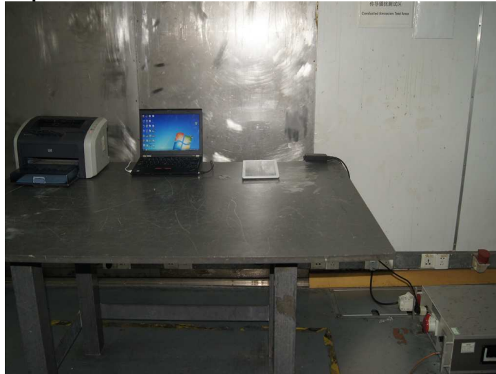
Photograph 1: Set-up for Conducted Emission