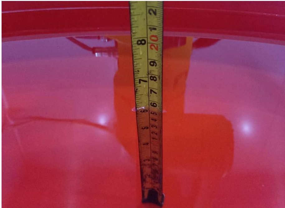
Photograph 1: Set-up for Test Layout