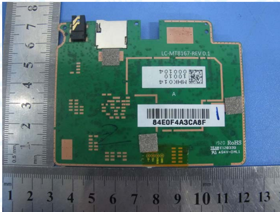
Photo 14 Appearance of PCB