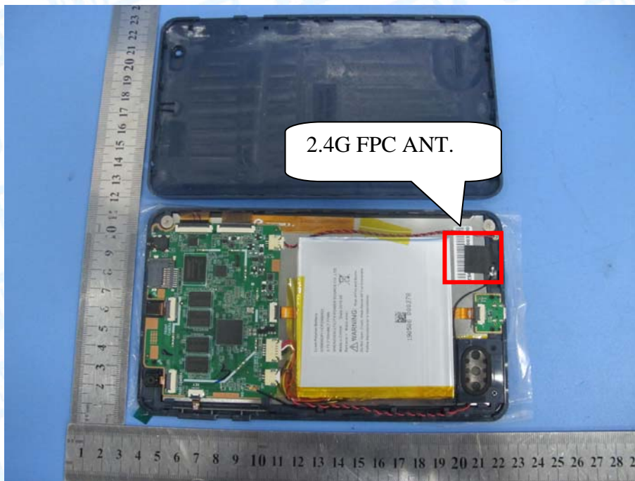
Photo 10 Internal of PCB