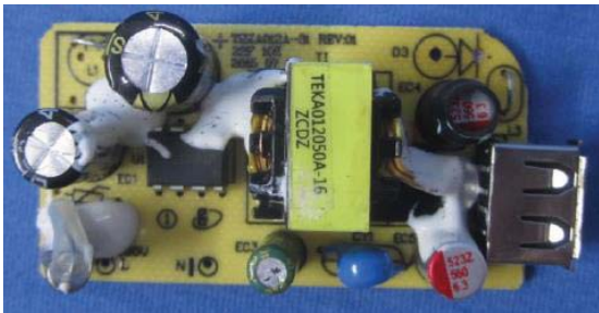
PCB Side 1

We, the undersigned hereby declare, that we only changed the adapter panel as below. Adapter Model No.: TEKA012-0502000UK