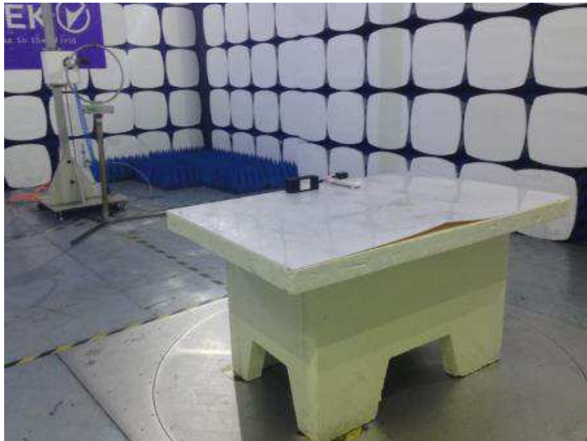
Photograph 2: Set-up for Radiated Spurious Emissions (30MHz-1GHz)