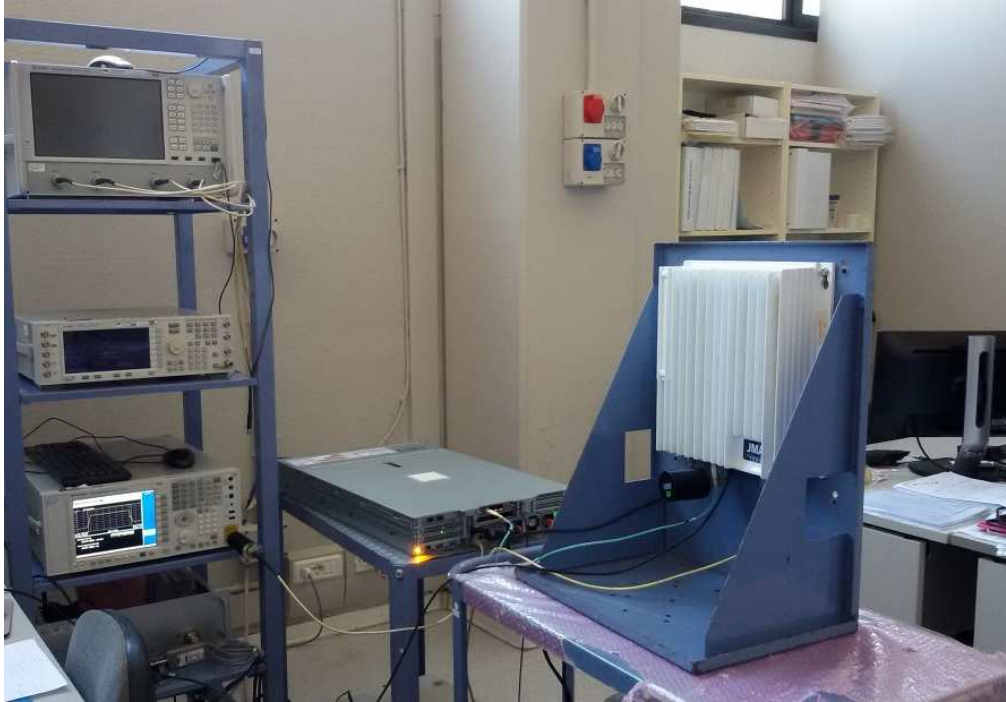
Photo Set up