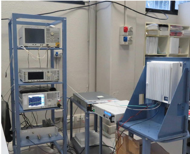
Photo Set up