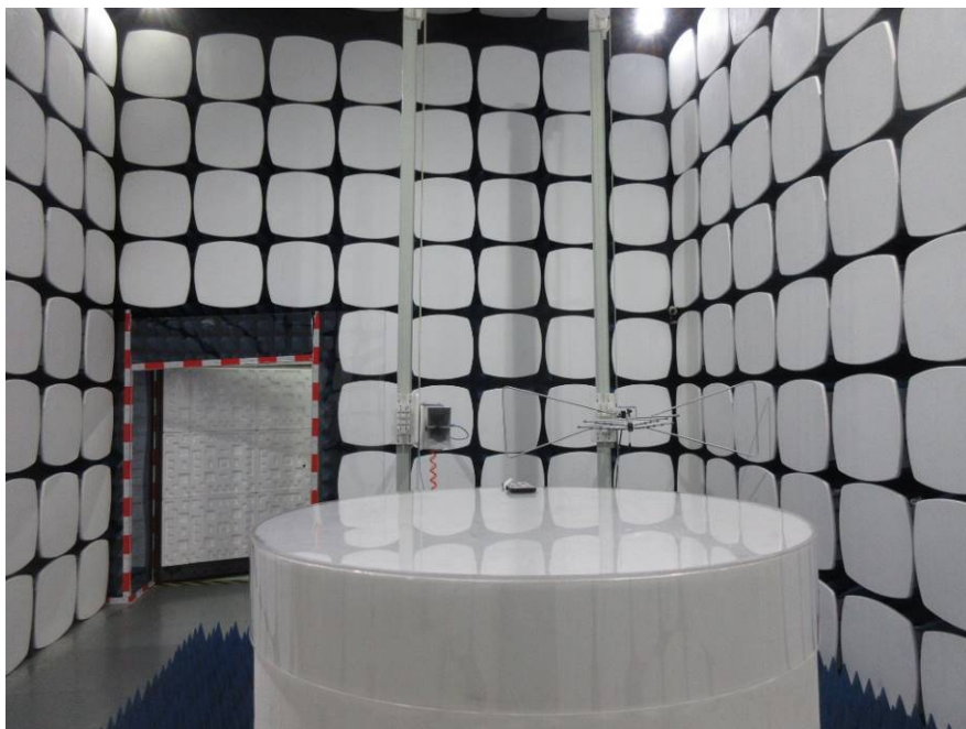
Radiated Emissions Below 1GHz

Field Strength of the Fundamental Signal (15.249(a)) & Radiated Emissions Above 1GHz & Restricted Band Around Fundamental Frequency