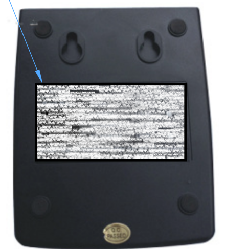
UNIT LABEL ON BACK

PROPRIETARY INFORMATION DATA CONTAINED WITHIN BELONGS TO WIND HARDWARE & ENGINEERING, WINDMADE PRODUCTS, ZEPHYR LOCKS AND/OR ZEPHYR FLUID SOLUTIONS AND SHALL NOT BE DISTRIBUTED OUTSIDE THE RECIPIENTS FACILITY AND SHALL NOT BE DUPLICATED, USED, OR DISCLOSED IN WHOLE OR IN PART FOR ANY PURPOSE OTHER THAN EVALUATION OR MAINTENANCE OF THIS MATERIAL. NO RIGHT IS GRANTED FOR THE MANUFACTURING IN WHOLE OR IN PART OF ANY ITEMS ON THIS DRAWING WITHOUT THE WRITTEN CONSENT FROM ONE OF THE ENTITIES LISTED.