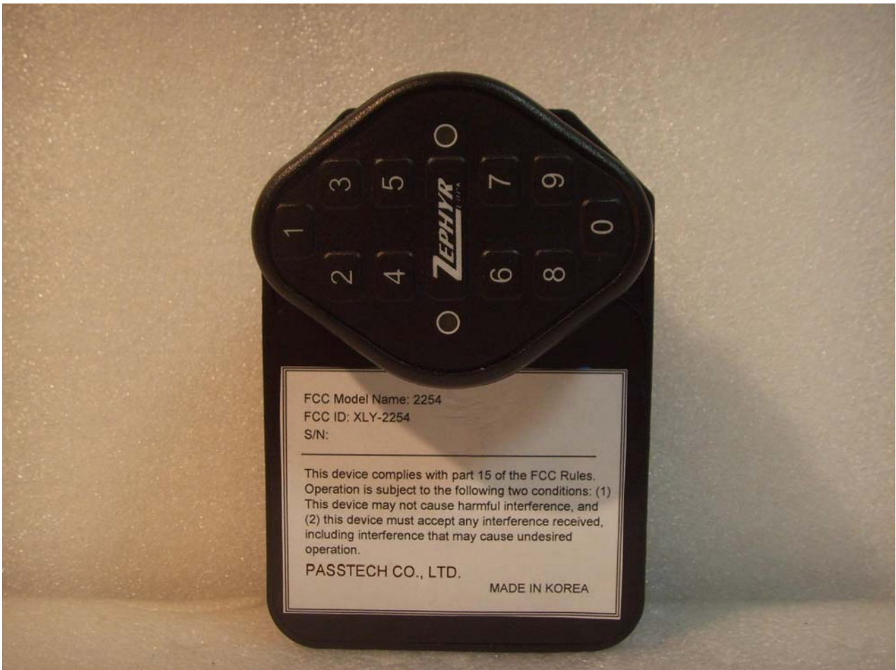
Figure 1.2 LABEL LOCATION

The label shown shall be permanently affixed at a conspicuous location on the device and be readily visible to the user at the time purchase.(Labeling requirements per 2.925)