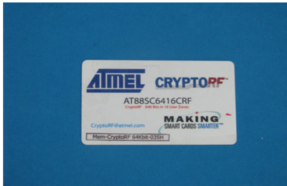
RFID Card External View