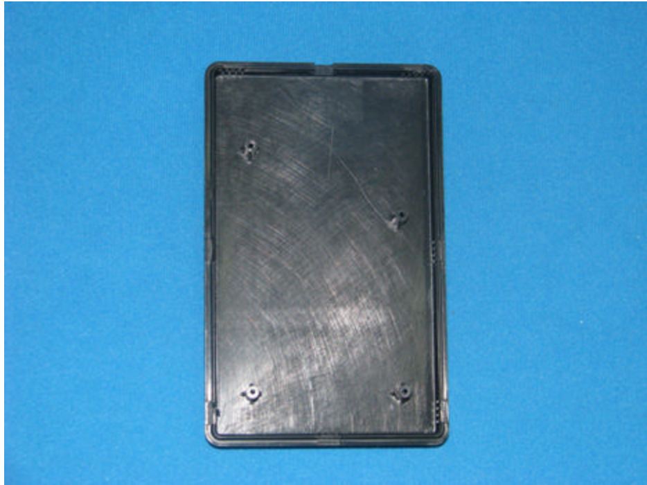
Top Cover Internal View