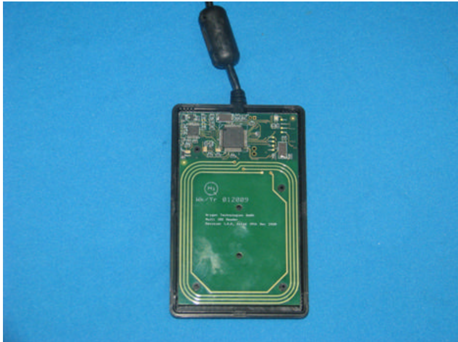
Bottom Cover Internal View ( with PCB )