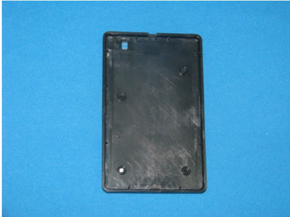
Bottom cover Internal view