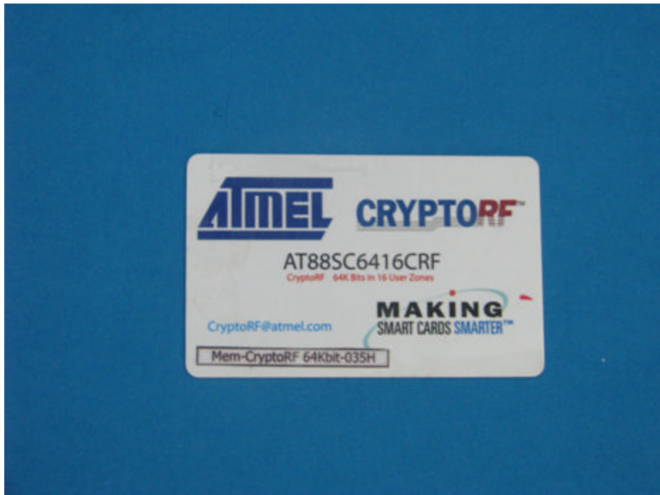
RFID Card External View