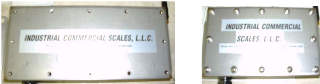
Loadcell Transceiver (Left)