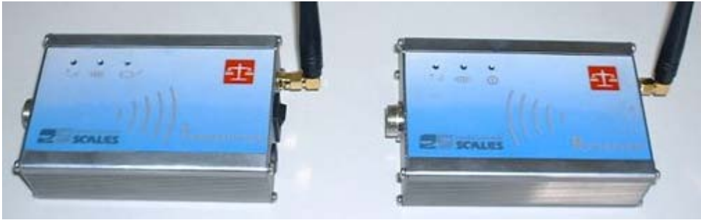
Loadcell Transceiver (Left)