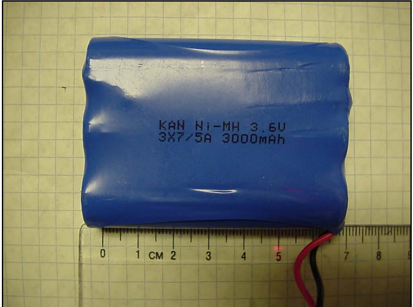
Photograph 13: Battery