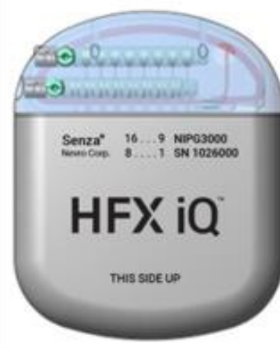
Final device marking