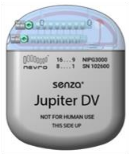
Verification device marking

Devices used for verification testing, including compliance testing, are laser etched as Senza Jupiter DV. Final product devices will be laser etched as shown with the product name HFX iQ. Except for the marking on the can, there are no differences between these devices.