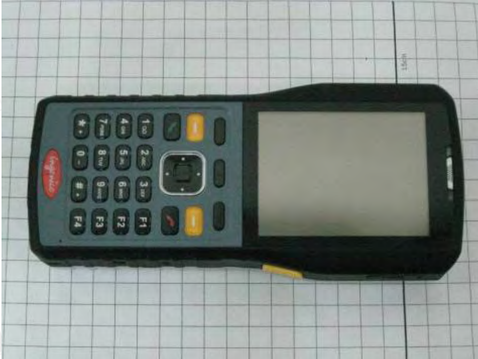
Fig.3 Front view of device