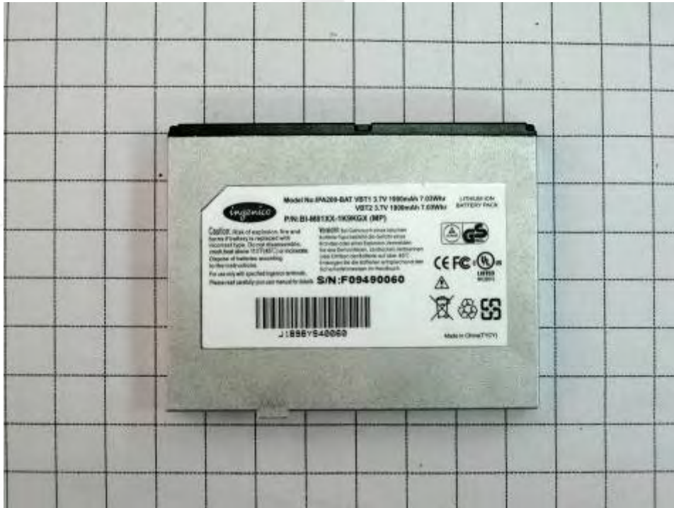
Fig.5 Front view of Battery