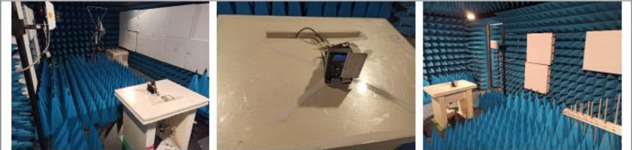
Axis XY on anechoic chamber (80cm)