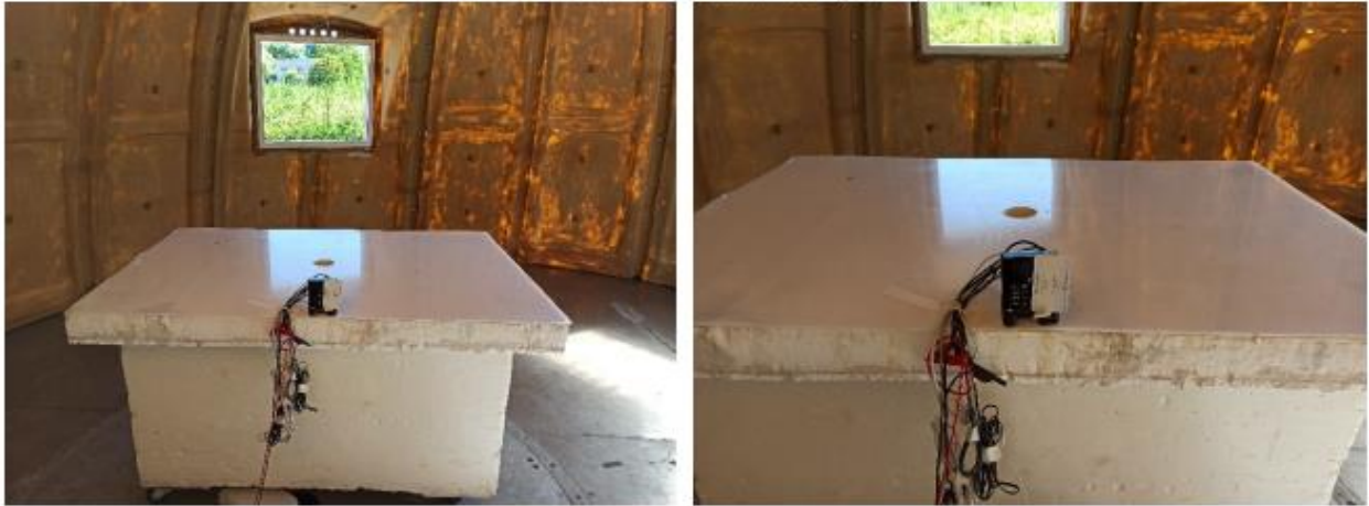
Axis XY on OATS (80cm)

Photograph for Field strength outside of the bands 13.110-14.010 MHz