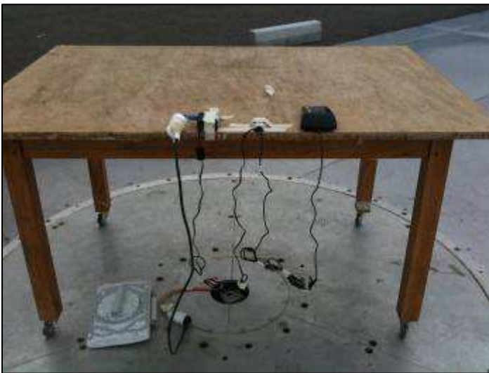
Configuration n°2 (RS232 Mode, 312A-0101)