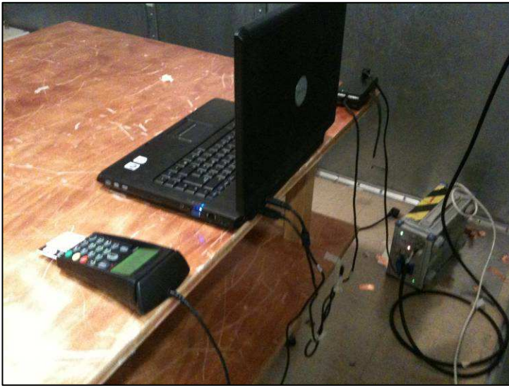
Configuration n°1 (USB Mode, 322A-0101)