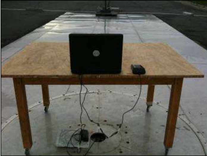
Configuration n°1 (USB Mode, 322A-0101)