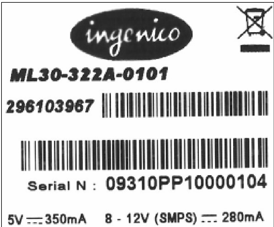
Label#1 (USB configuration)