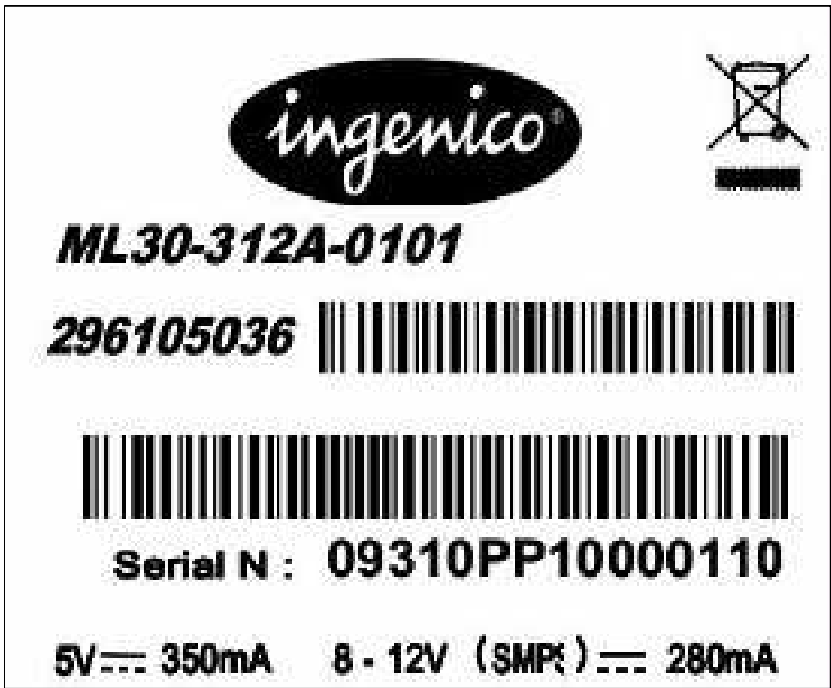
Label#1 (RS232 configuration)