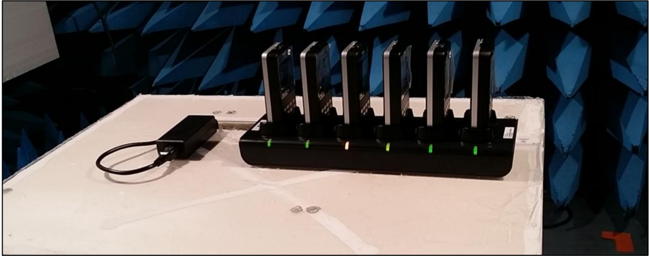
Test setup in anechoic chamber <1GHz