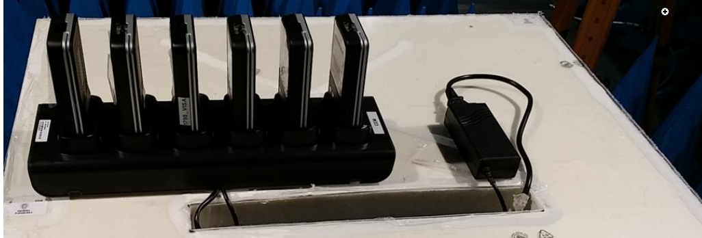
Test setup in anechoic chamber <1GHz