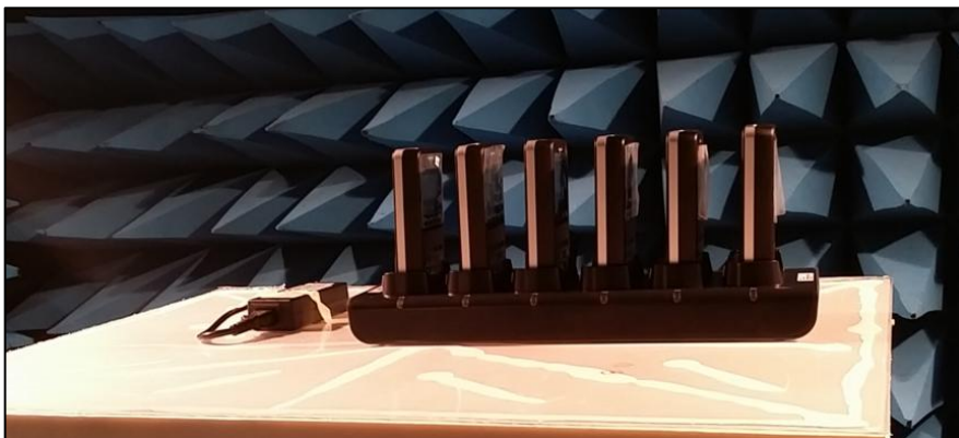
Test setup in anechoic chamber >1GHz