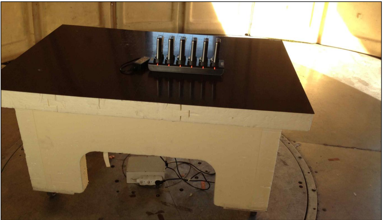
Test setup on OATS