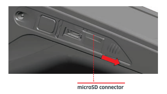
4_3 Opening trap door