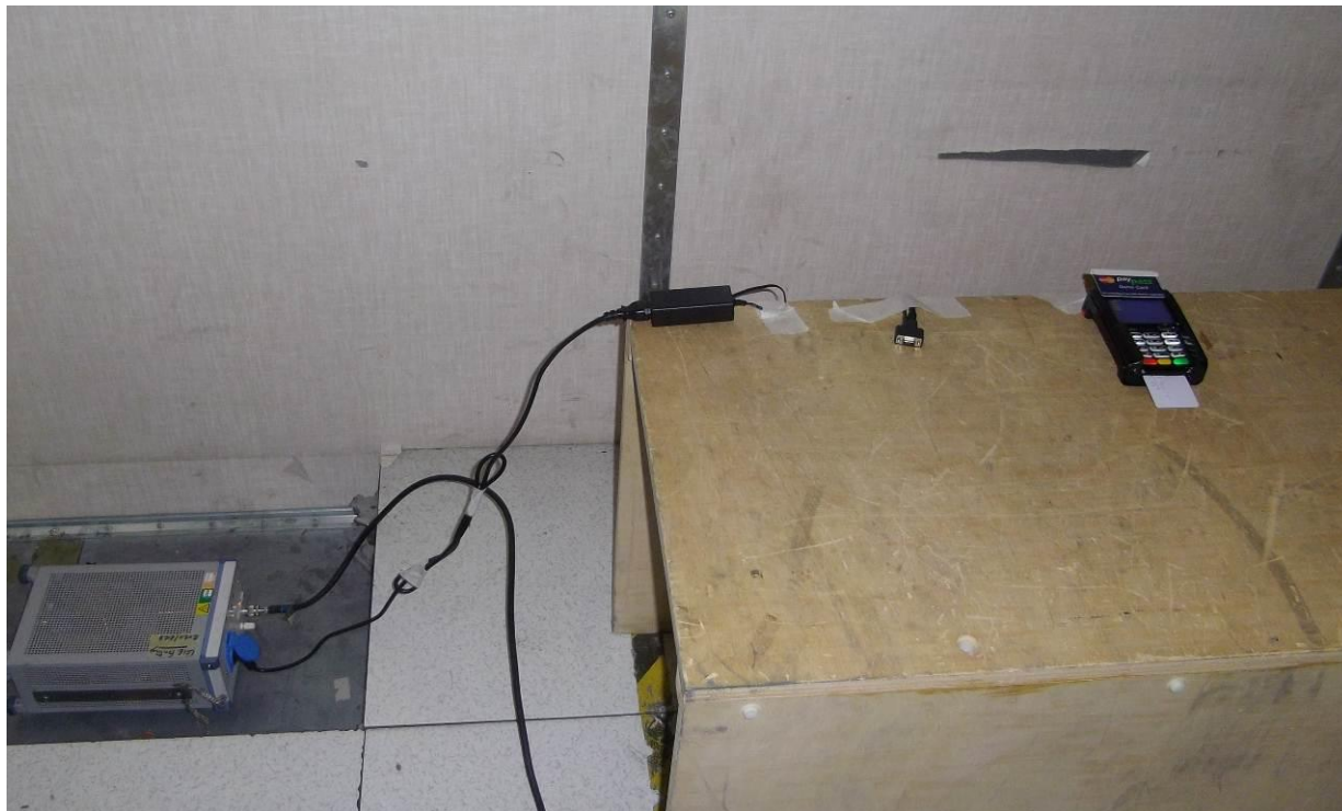
Conducted emission measurements