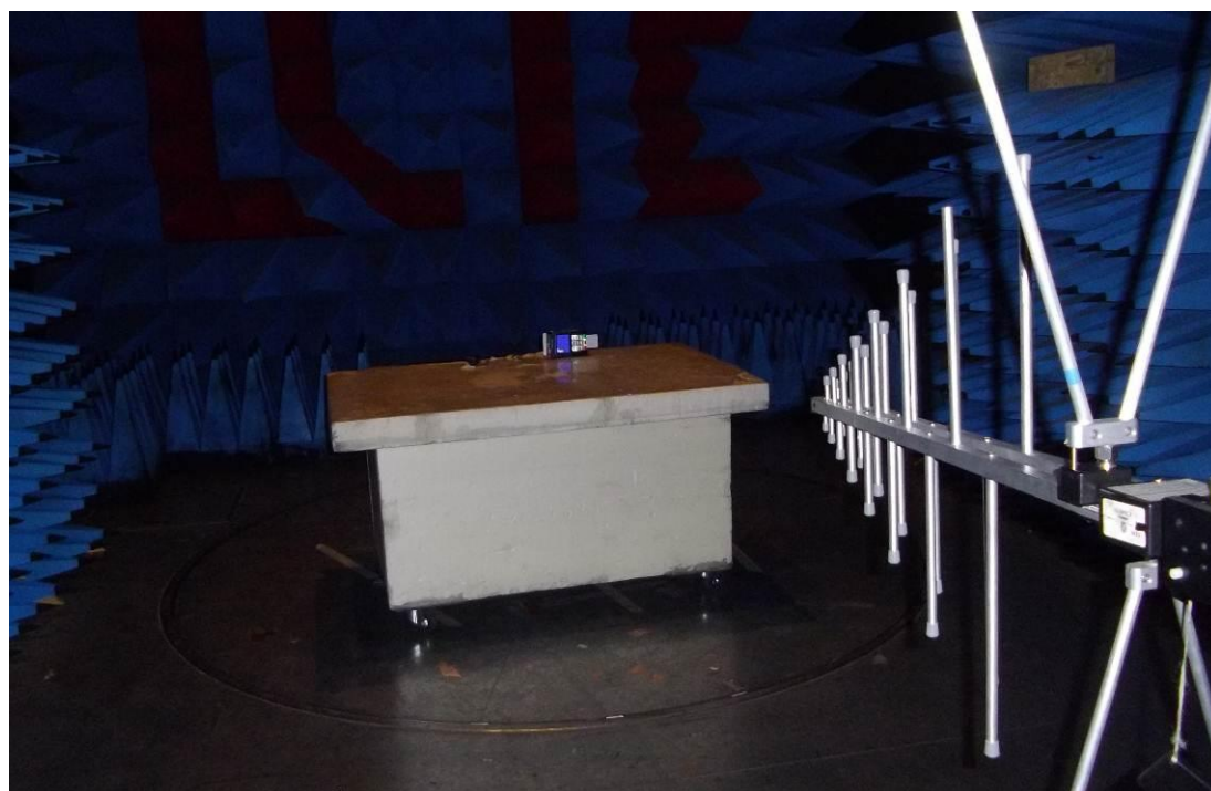
Radiated emissions measurements (below 1GHz)