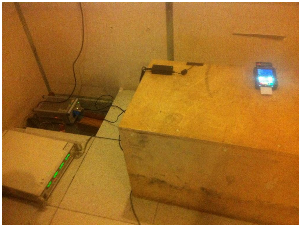
Conducted emission measurements

FCC ID: XKB-LANE5000CL IC: 2586D-LANE5000CL