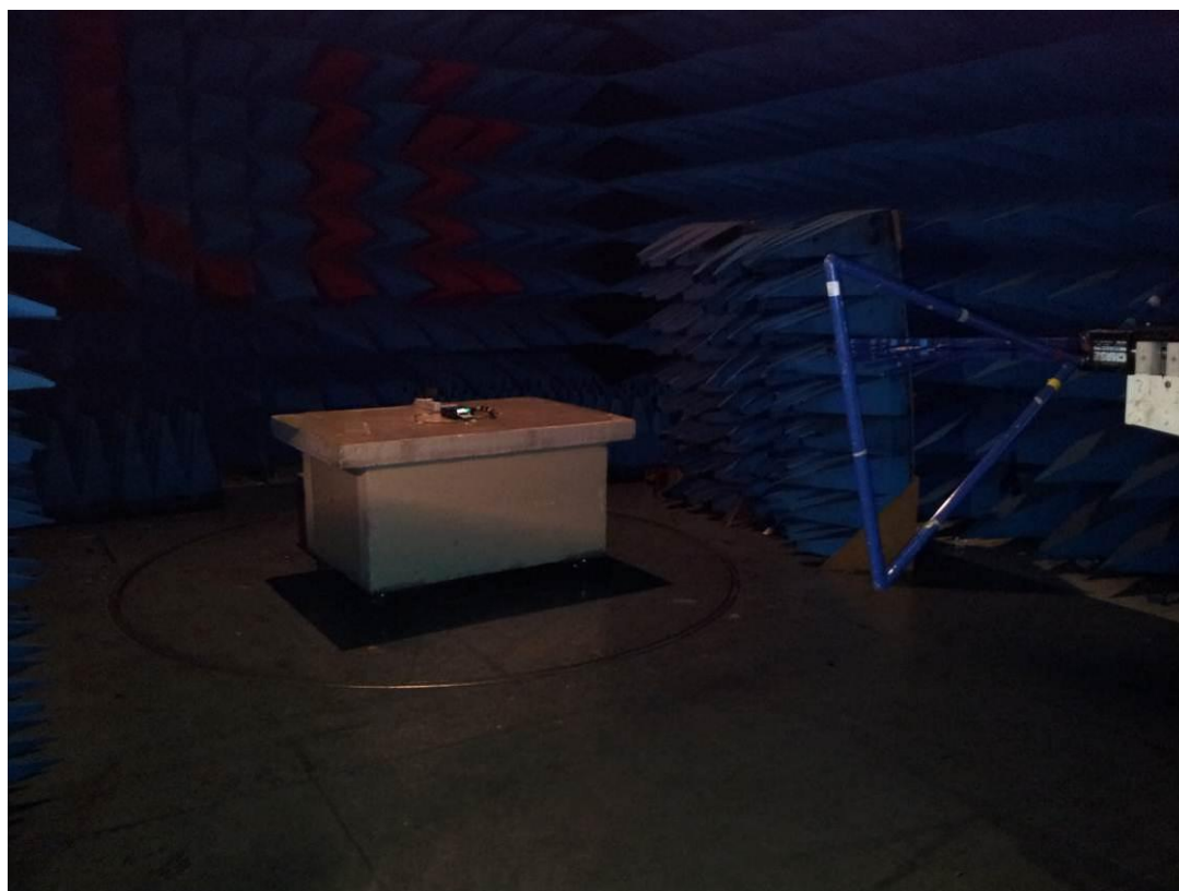
Radiated emissions measurements (below 1GHz)

FCC ID: XKB-LANE5000CL IC: 2586D-LANE5000CL