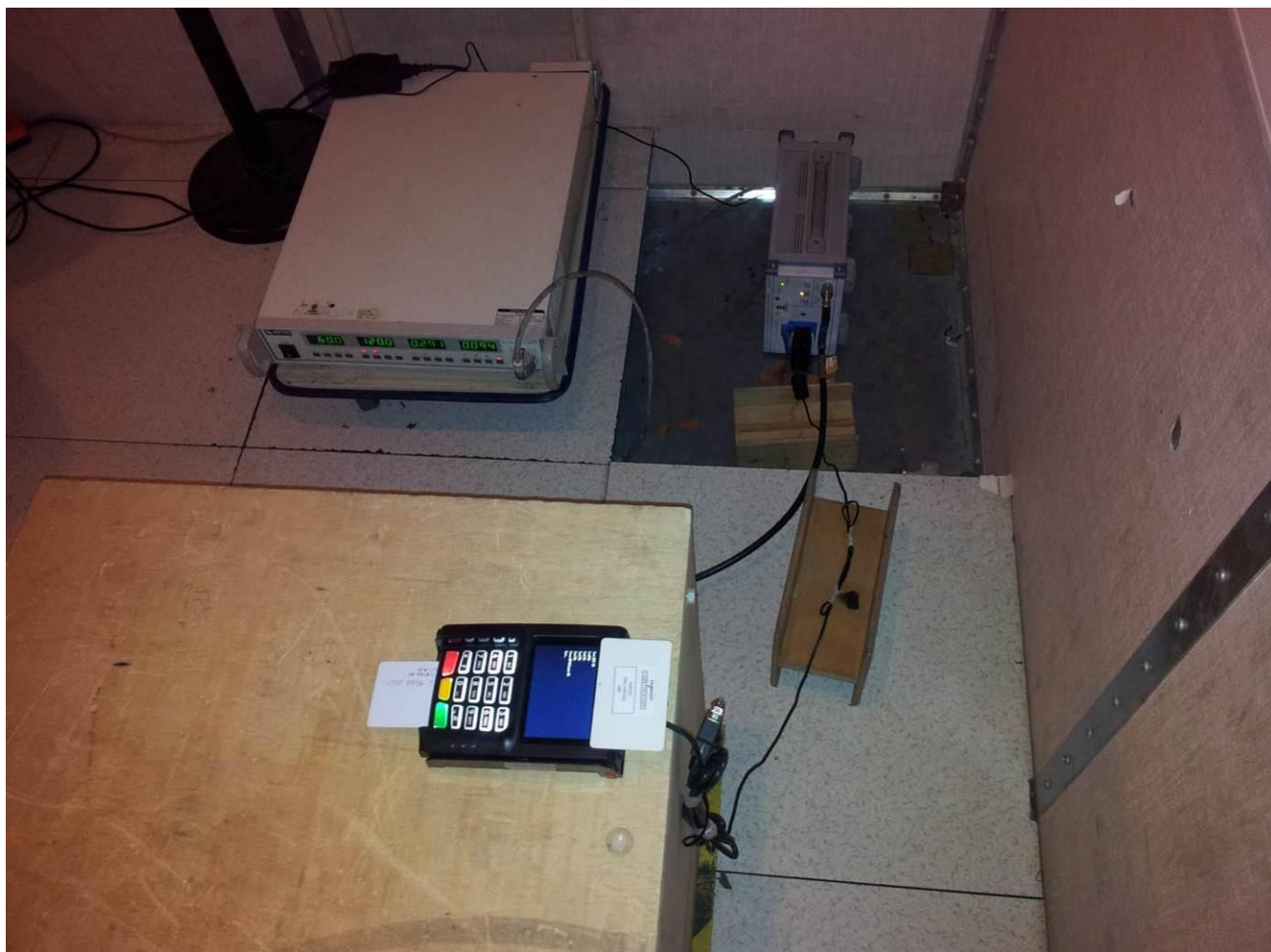
Conducted emission measurements