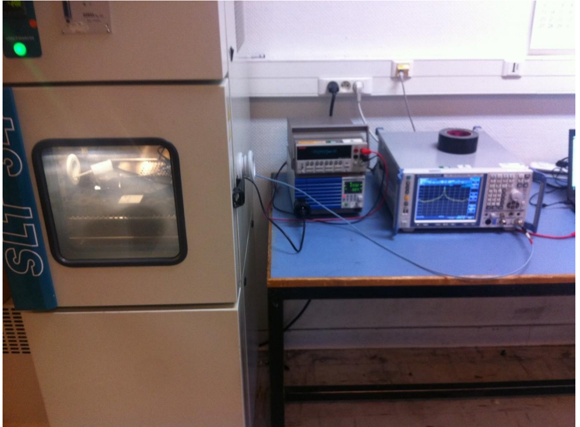
Photograph for Frequency Tolerance