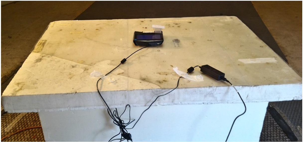
Photograph for Field strength outside of the bands 13.110-14.010 MHz