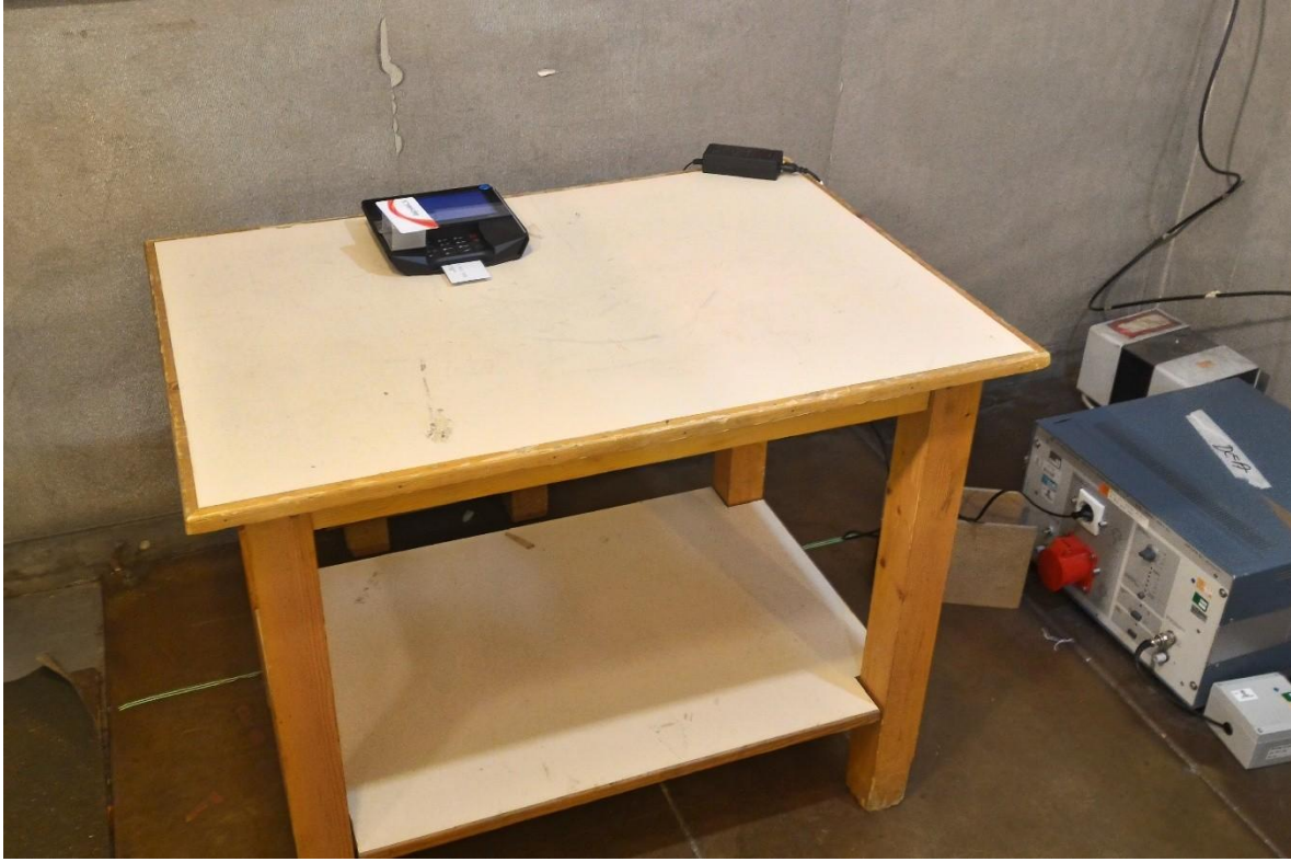
Photograph for AC Power Line Conducted Emissions (Front view)