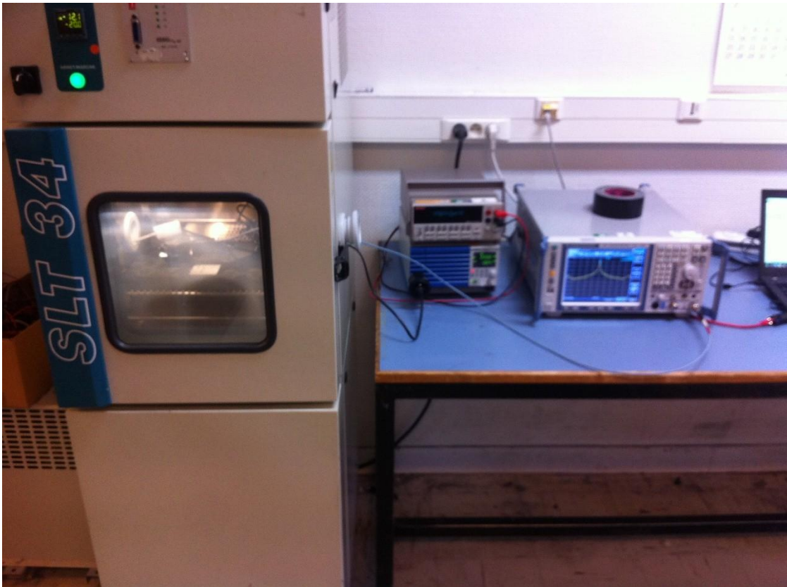
Photograph for Occupied bandwidth