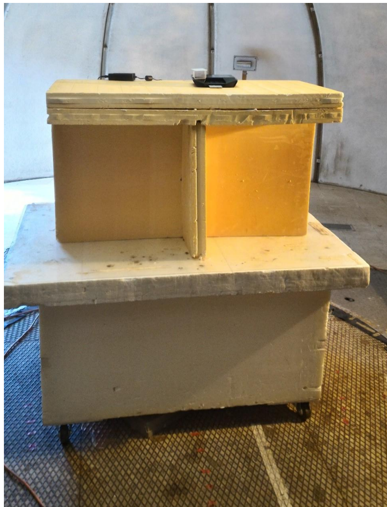
Photograph for Field strength outside of the bands 13.110-14.010 MHz