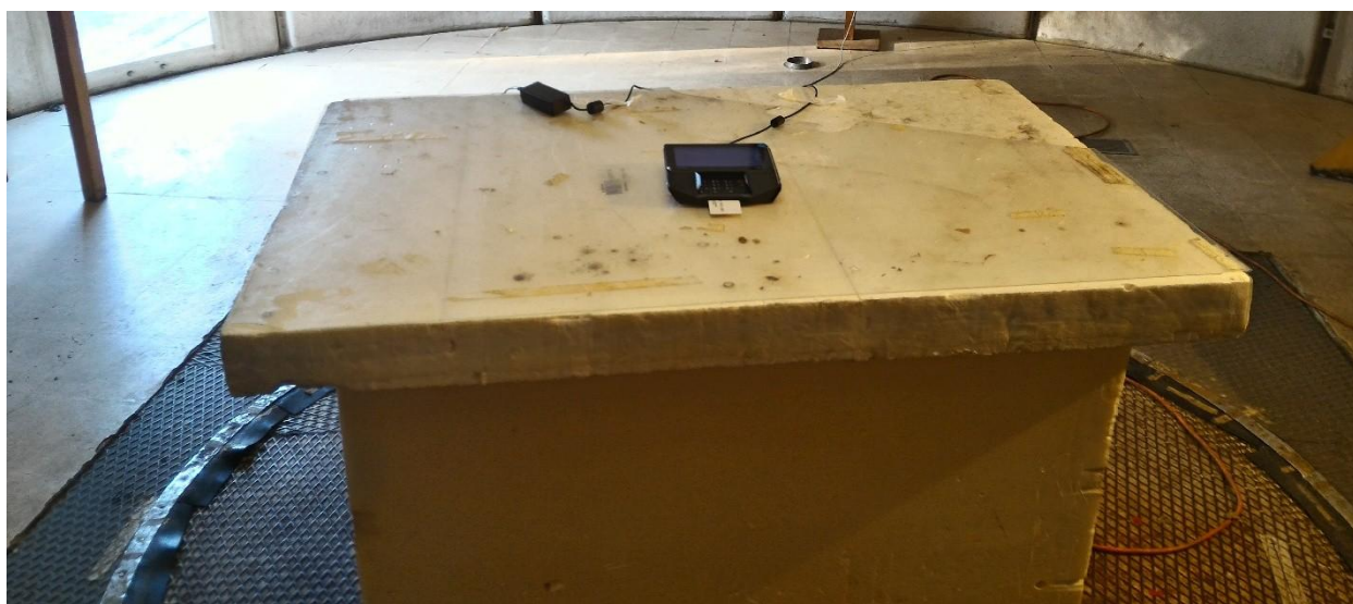
Photograph for Field strength outside of the bands 13.110-14.010 MHz