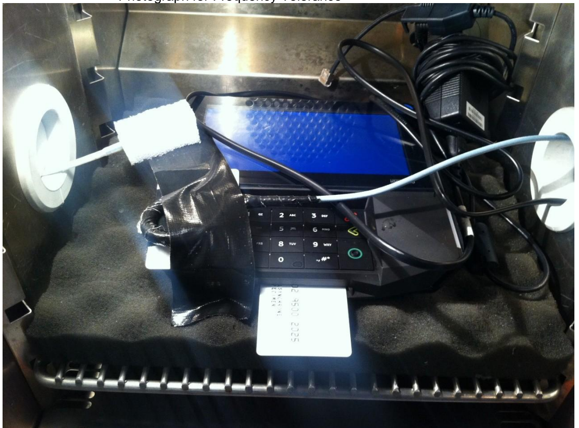
Photograph for Frequency Tolerance