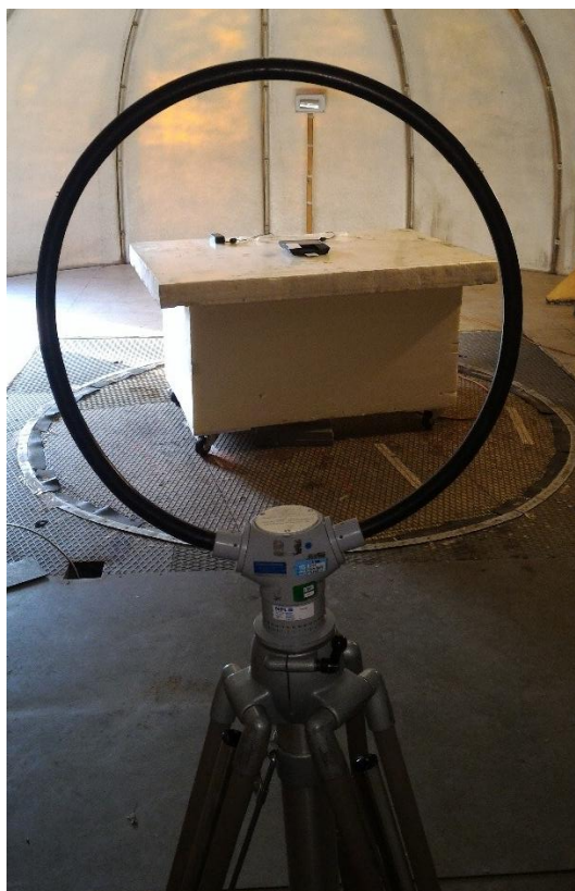
Photograph for Field strength within the band 13.110-14.010MHz