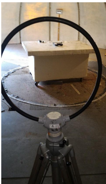
Photograph for Field strength outside of the bands 13.110-14.010 MHz